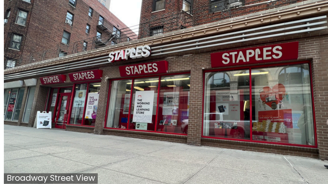
Broadway Street View

All information supplied in this marketing presentation and/or flyer is from sources deemed reliable and is furnished subject to errors, omissions, modifications, removal of listings from sale/lease and to any listing condition. Any square footage, dimensions, floor plans and/or technical data set forth are approximations and are subject to further elaboration/confirmation.