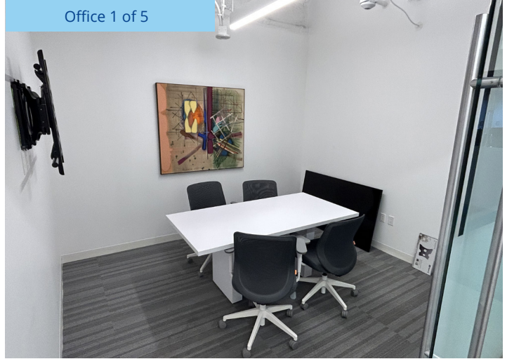
Office 1 of 5