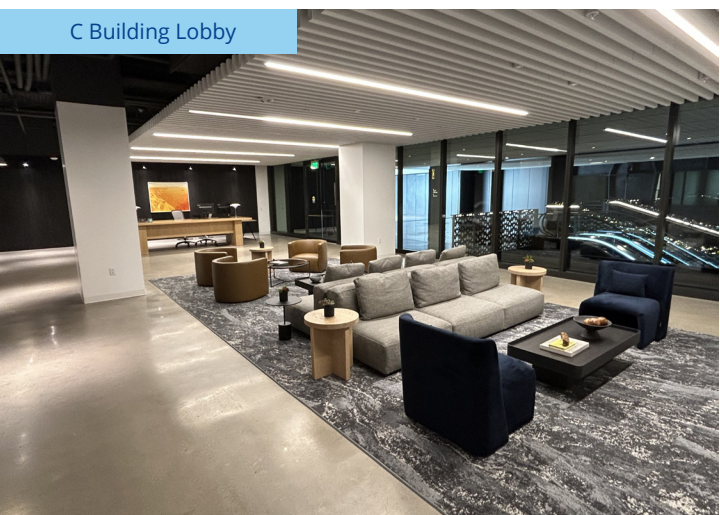
C Building Lobby