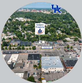
PRIME LOCATION RETAIL CORRIDOR