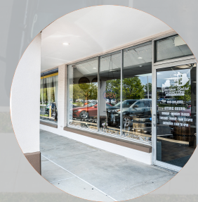
HIGH VISIBILITY STORE FRONTS