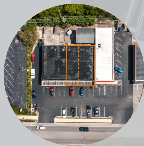
SEPARATE OR SINGLE SPACE LEASE