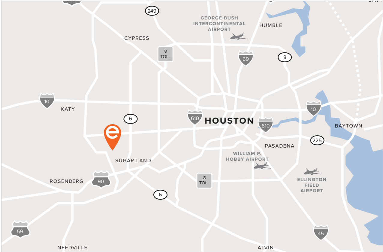
*Placer.ai Data July 2021 - June 2021