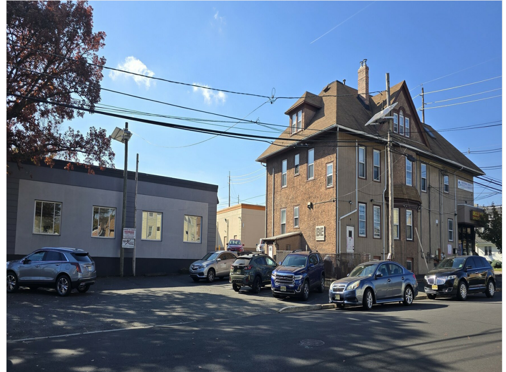
Rear view with parking lot