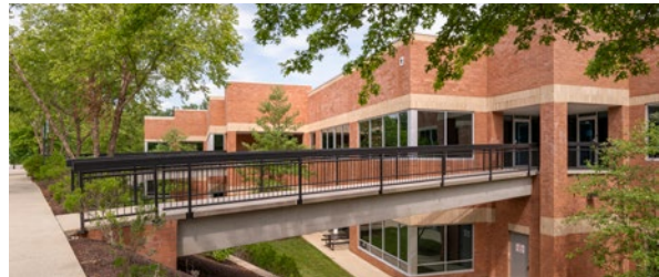
16900 Science Drive

Melford Town Center’s two-story office buildings located along Science Drive offer an over-and-under style of architecture. This style provides direct street access from the second floor.