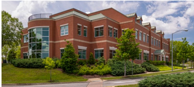
17251 Melford Boulevard

Melford Town Center includes three Class 'A' multi-story office buildings totaling more than 327,000 square feet of space. Tenant sizes from 1,252 square feet to 150,000 square feet of space offer businesses headquarters-worthy location.