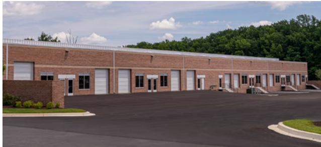
Top: Electric vehicle charging stations at 4961 Tesla Drive; Bottom: Drive-in loading with wide truck court