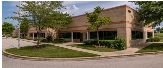
17001 Science Drive

Melford Town Center’s single-story office building is located along Science Drive and offer businesses direct-entry 24/7 access.