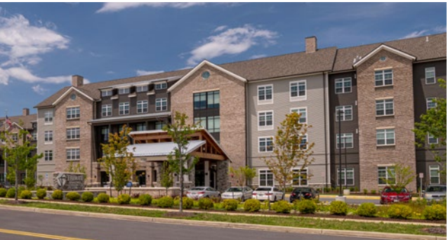
Tribute at Melford Town Center

For more information on the residential component at Melford Town Center, visit: MelfordTownCenter.com