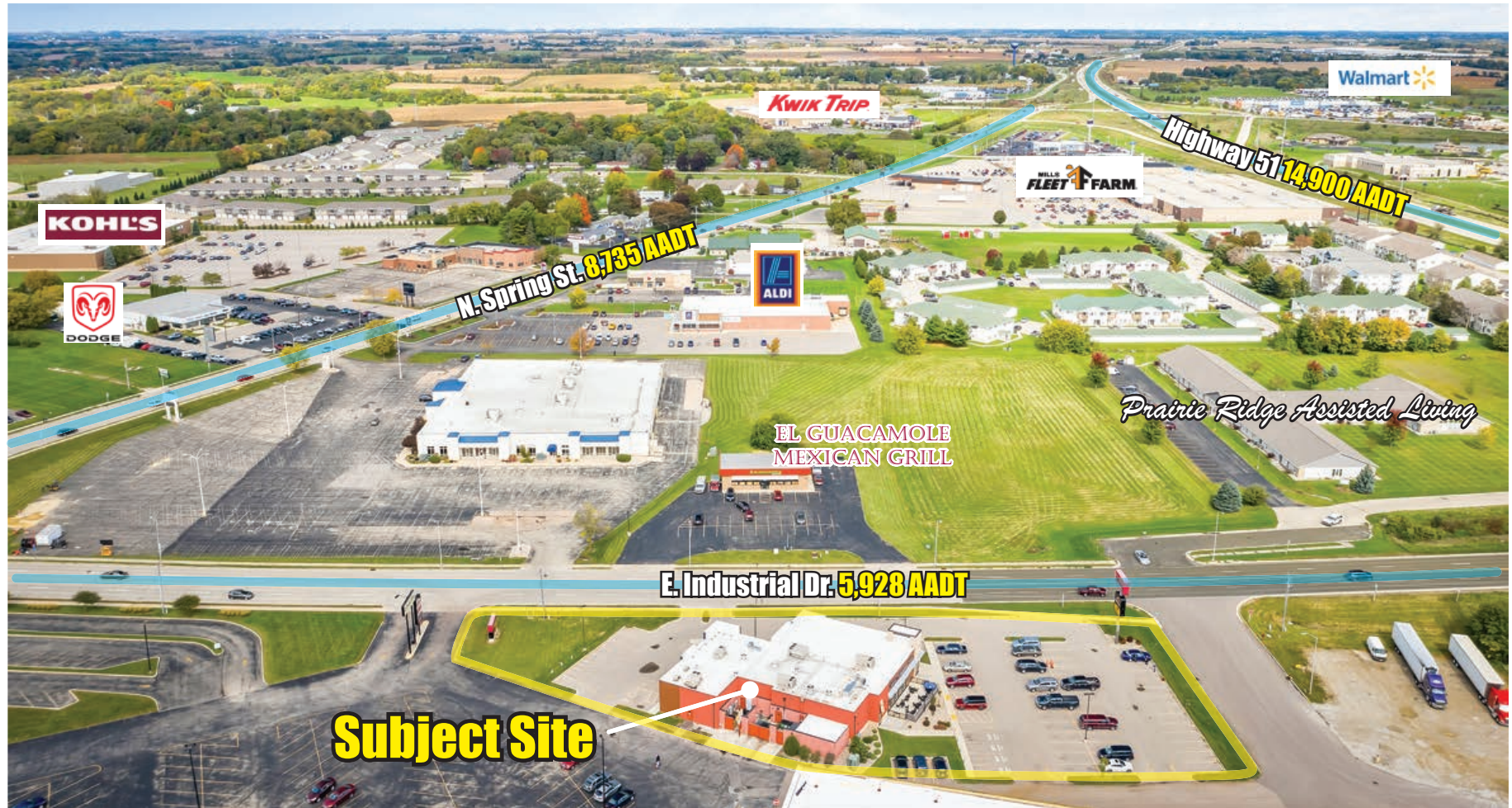
Trade Area Aerial (North)

115 East Industrial Drive, Beaver Dam, WI