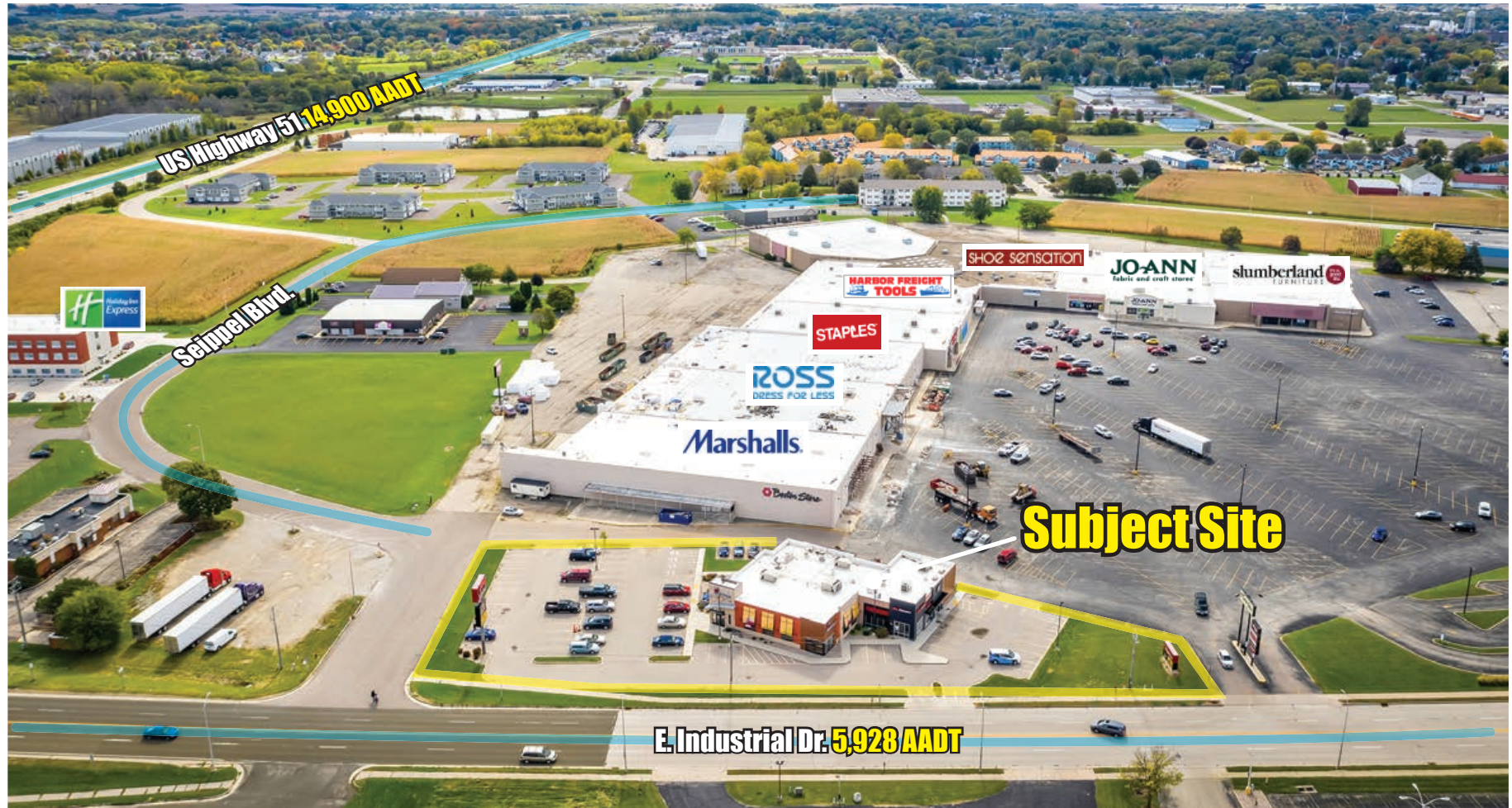
Trade Area Aerial (South)

115 East Industrial Drive, Beaver Dam, WI