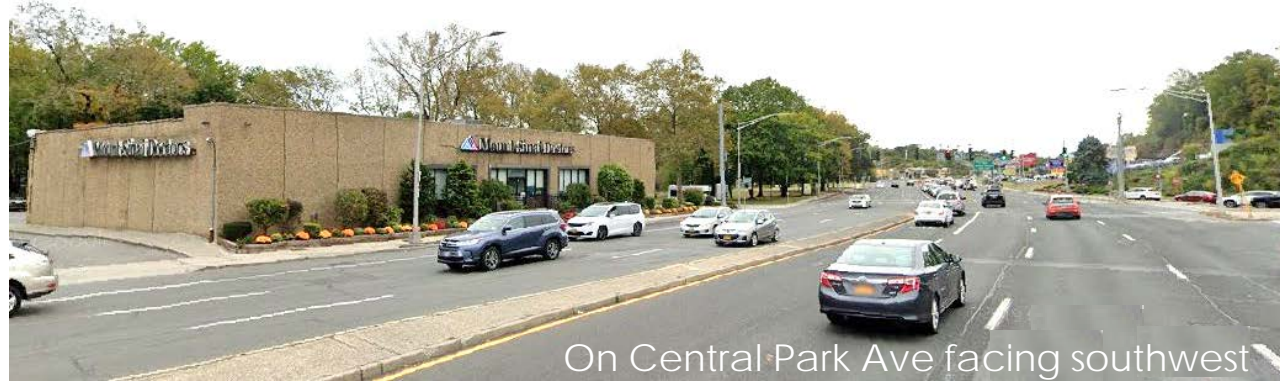
On Central Park Ave facing southwest