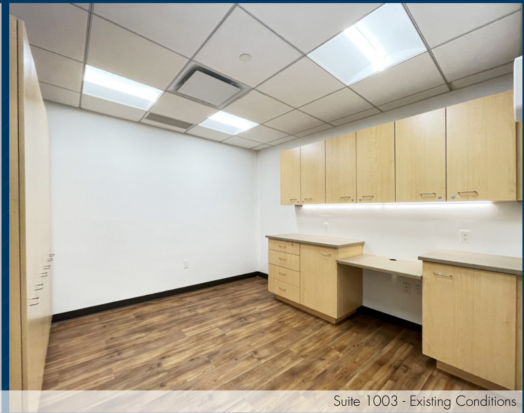
Suite 1003 - Existing Conditions