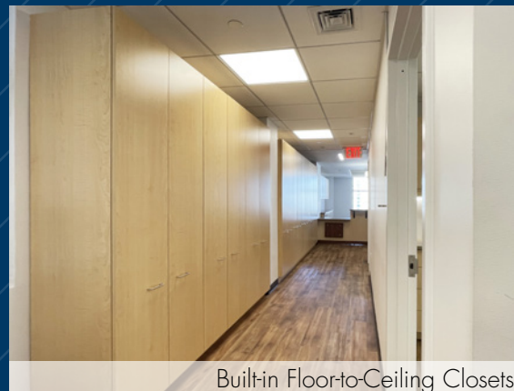
Built-in Floor-to-Ceiling Closets