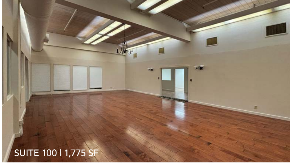
SUITE 100 | 1,775 SF