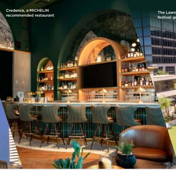
Credence, a MICHELIN recommended restaurant