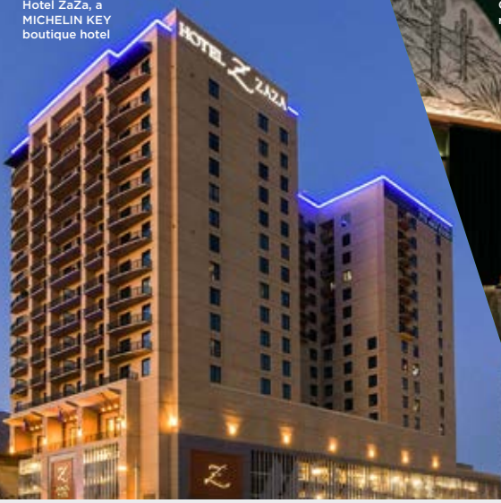
Hotel ZaZa, a MICHELIN KEY boutique hotel