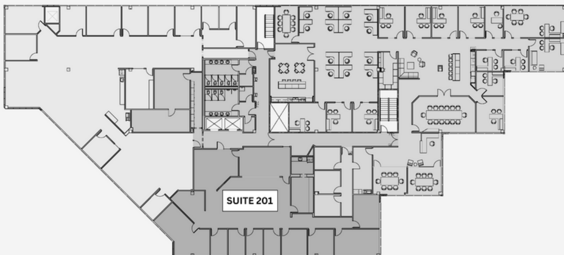
4,323 SF - SUITE 201

Anthony Caduff | anthony@davoscg.com | 615.400.1997