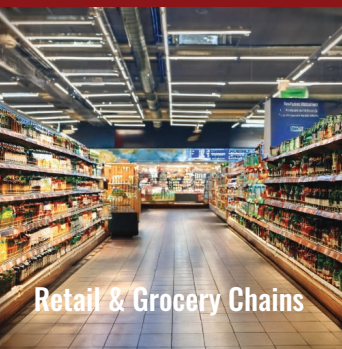
Retail & Grocery Chains