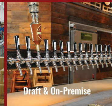
Draft & On-Premise