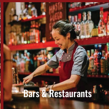
Bars & Restaurants