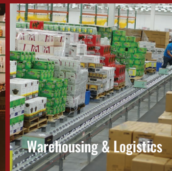
Warehousing & Logistics