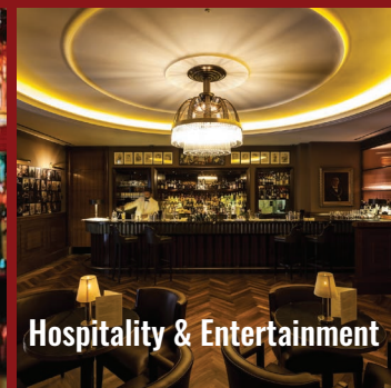
Hospitality & Entertainment