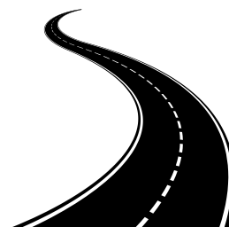
CLOSE PROXIMITY TO MAJOR HIGHWAYS