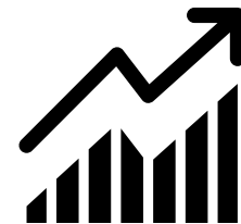
HIGH RETAIL EXPENDITURE