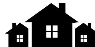
NUMEROUS SURROUDNING SUBURBS