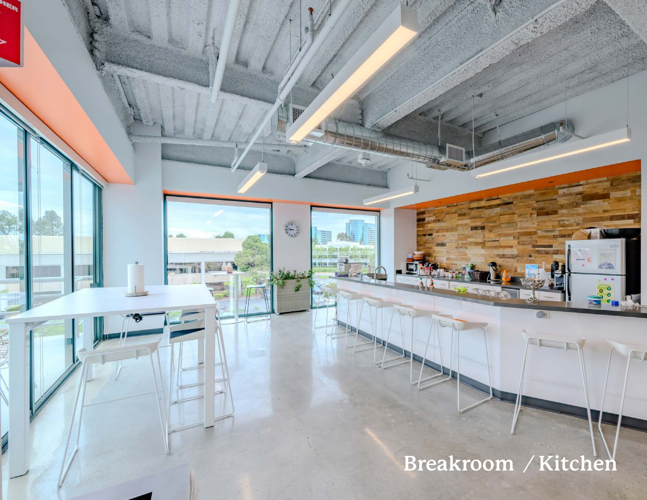
Breakroom / Kitchen