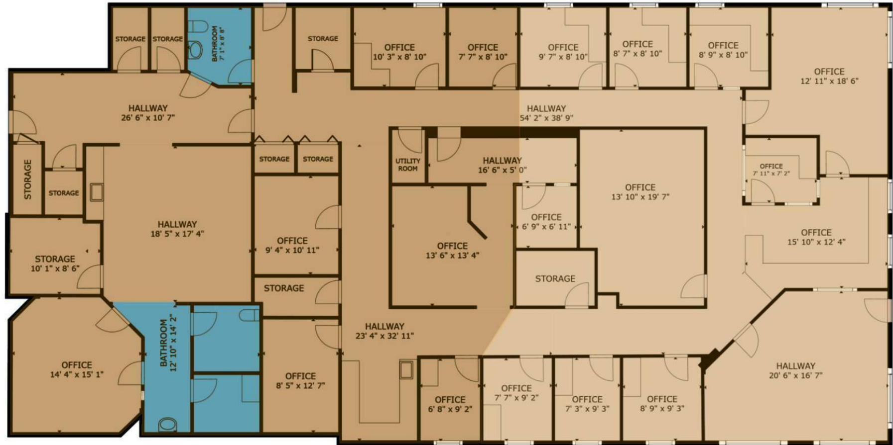
SUITE 101 2,525 SF