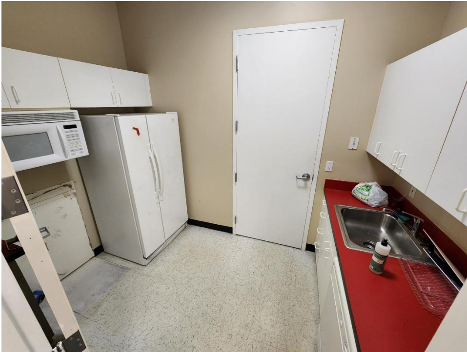
GROUP ROOM KITCHEN