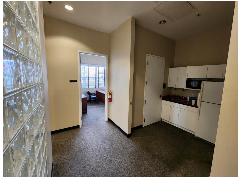
OFFICE WING KITCHEN & RESTROOM