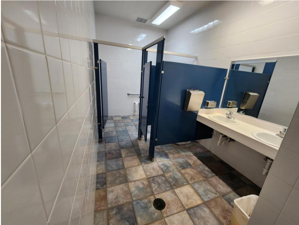
TWO FULL SIZE RESTROOMS WITH SHOWERS