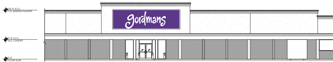
2 Existing Front Elevation (Chieftan Drive) SCALE: 1/8" = 1'-0"