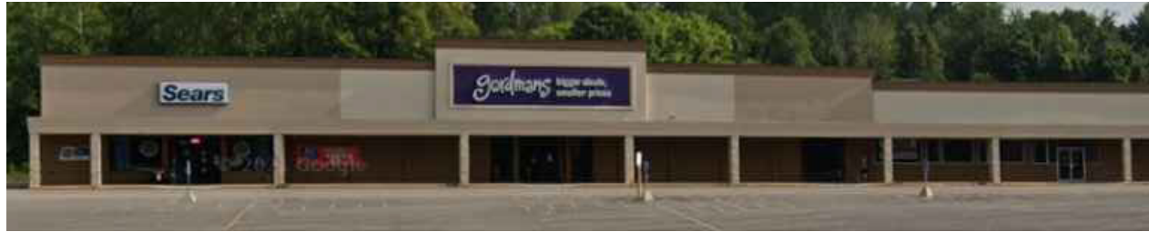
3 Existing Street View (Chieftan Drive) SCALE: NTS