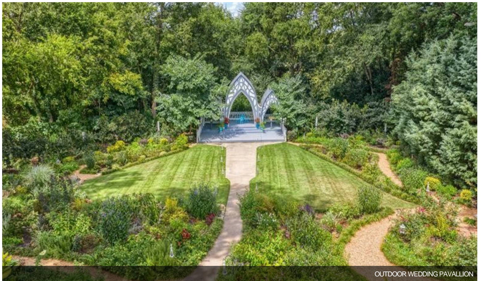
OUTDOOR WEDDING PAVILLION