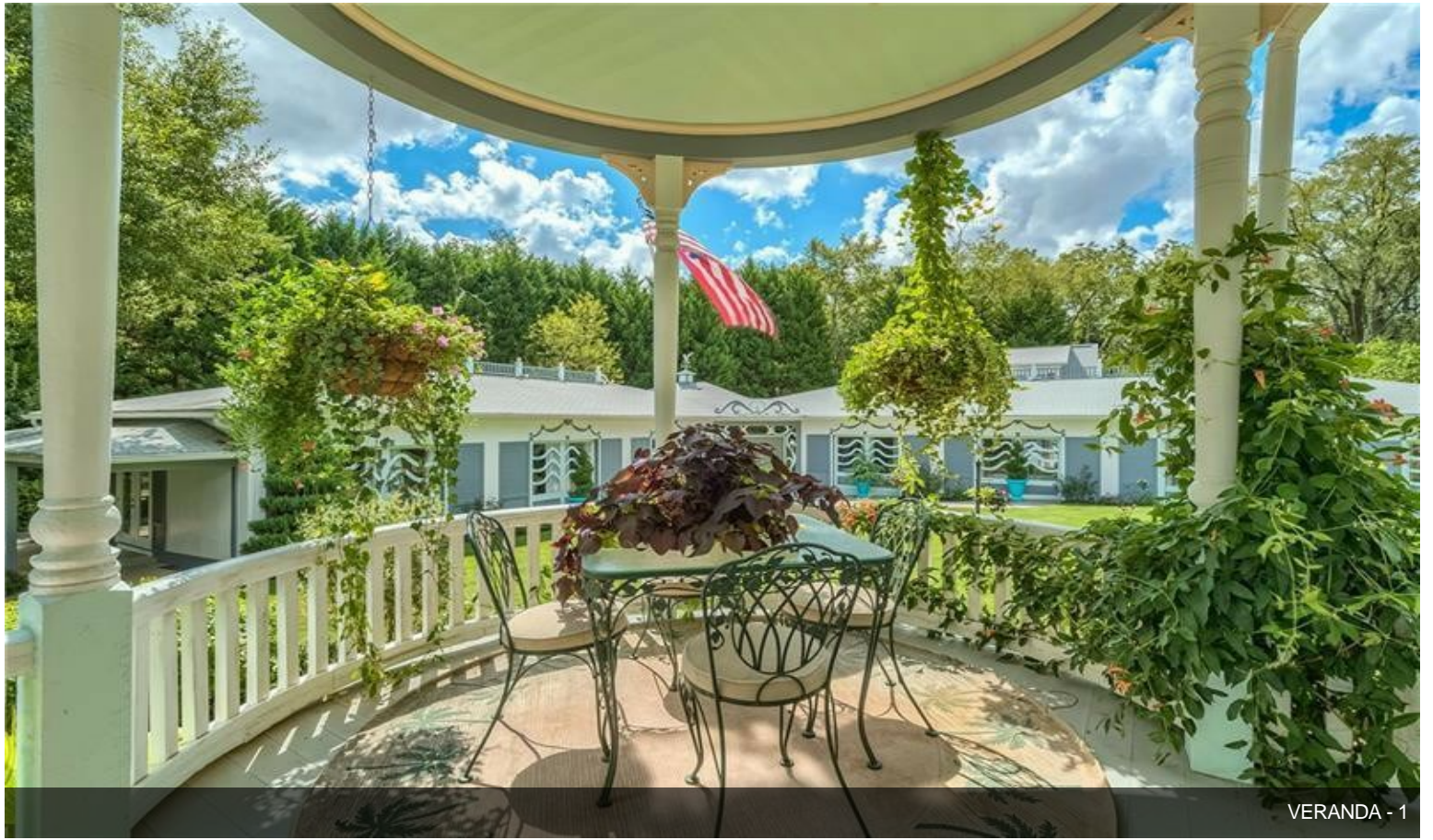
VERANDA - 1