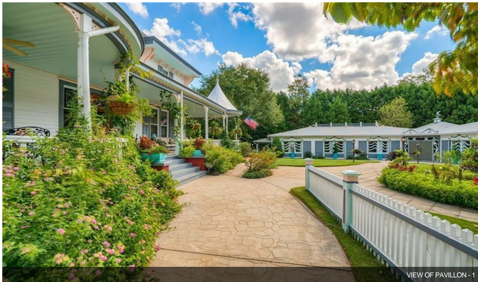
VIEW OF PAVILLON - 1