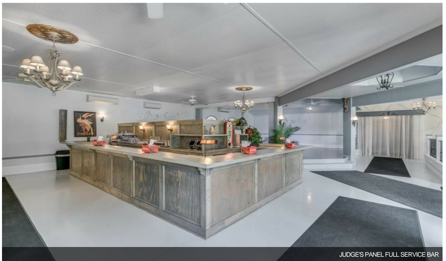
JUDGE'S PANEL FULL SERVICE BAR