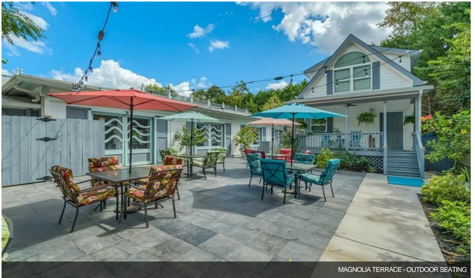
MAGNOLIA TERRACE - OUTDOOR SEATING