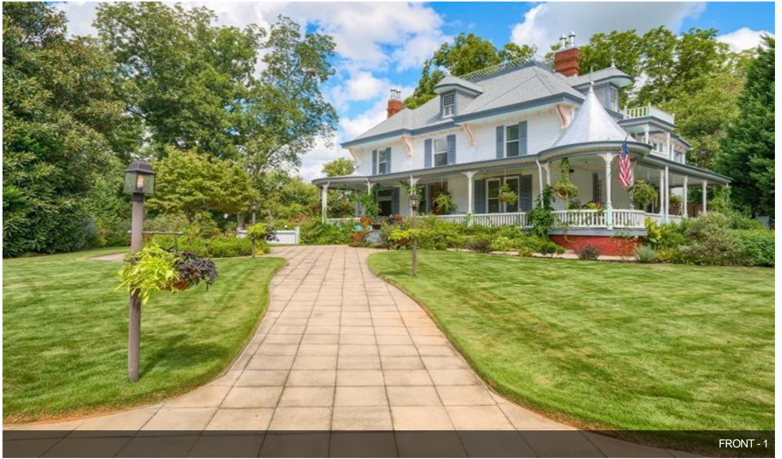
FRONT - 1