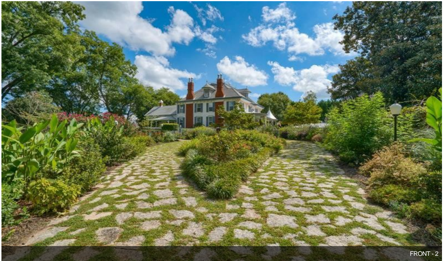
FRONT - 2