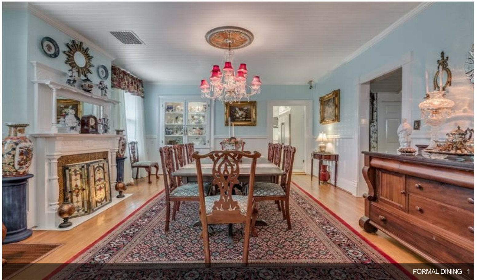
FORMAL DINING - 1