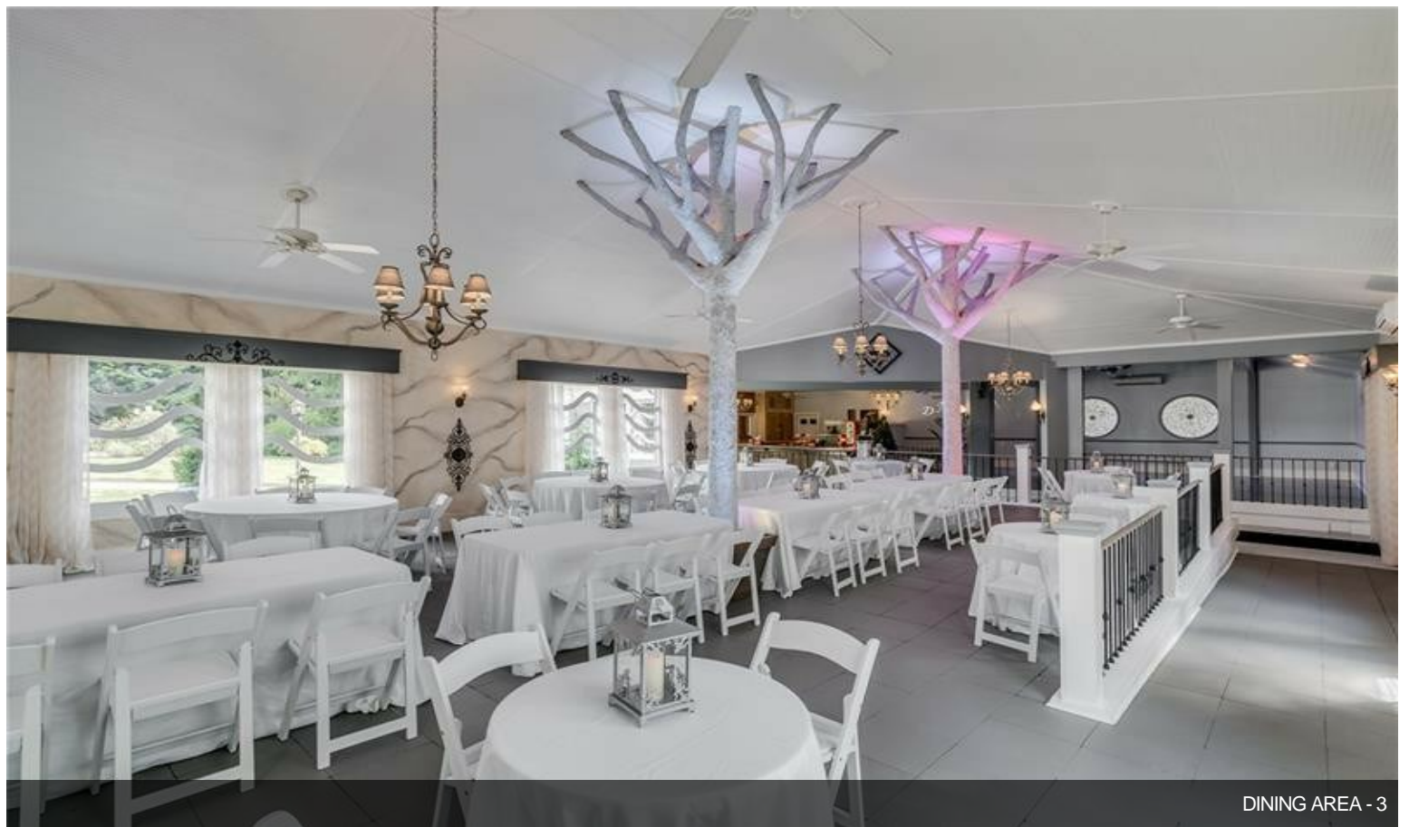
DINING AREA - 3