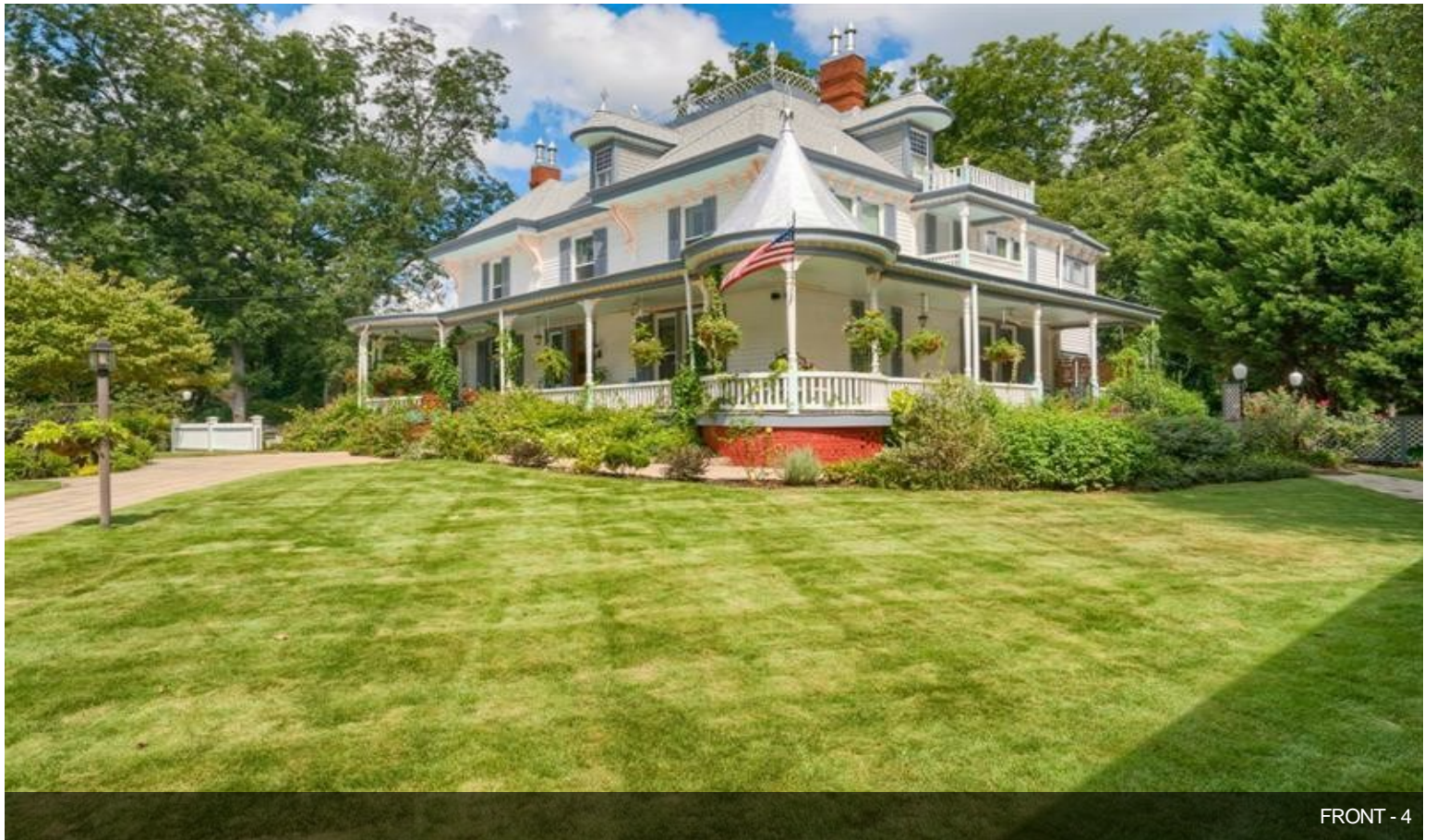
FRONT - 4