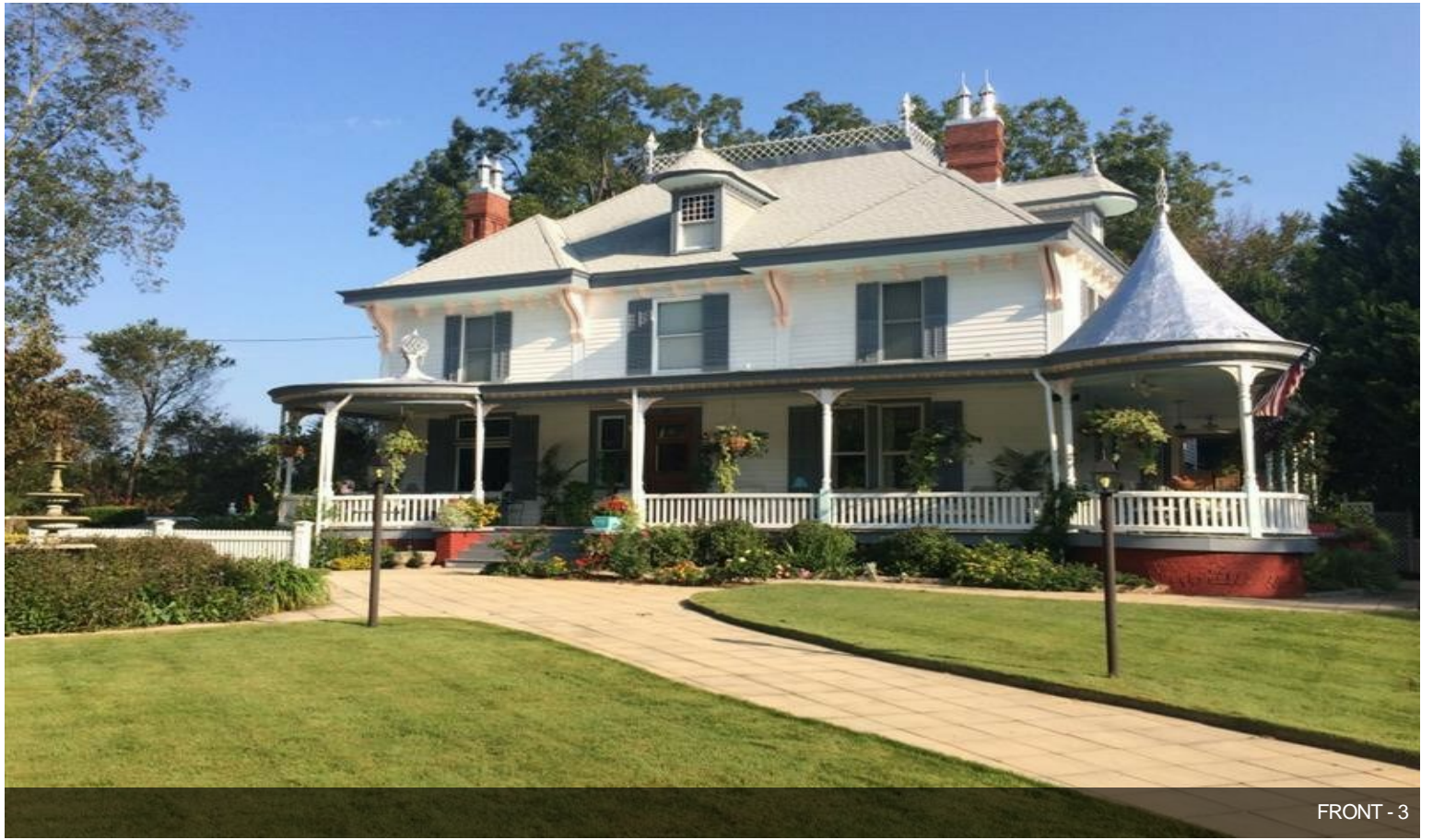
FRONT - 3