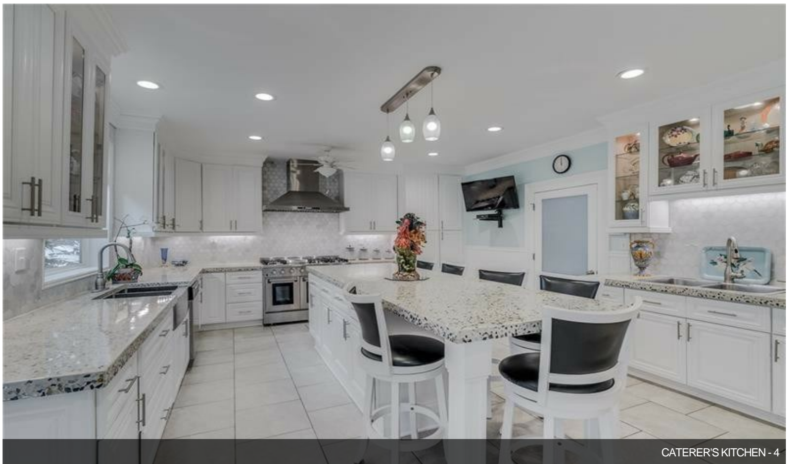
CATERER'S KITCHEN - 4