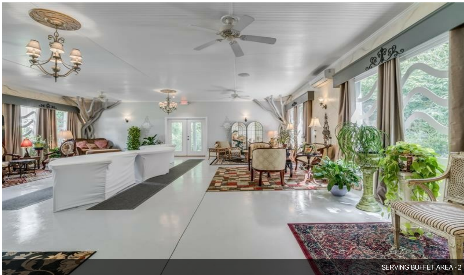
SERVING BUFFET AREA - 2