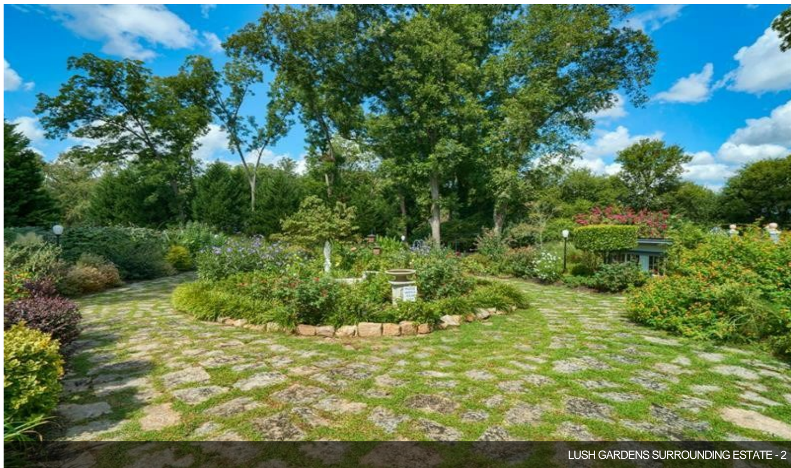
LUSH GARDENS SURROUNDING ESTATE - 2