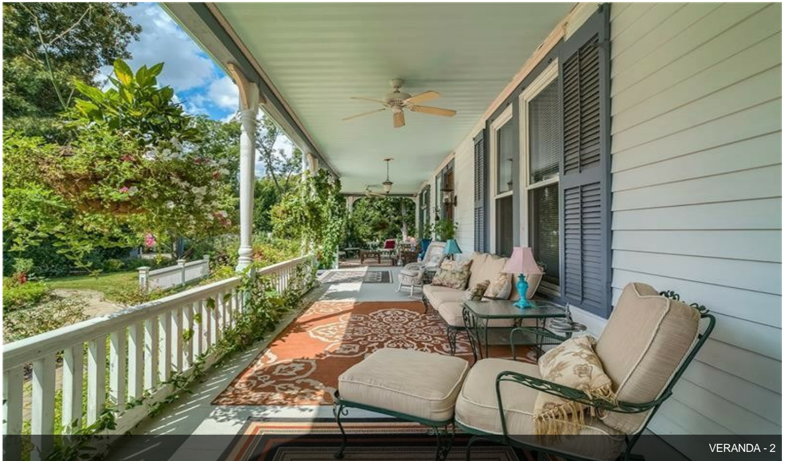
VERANDA - 2