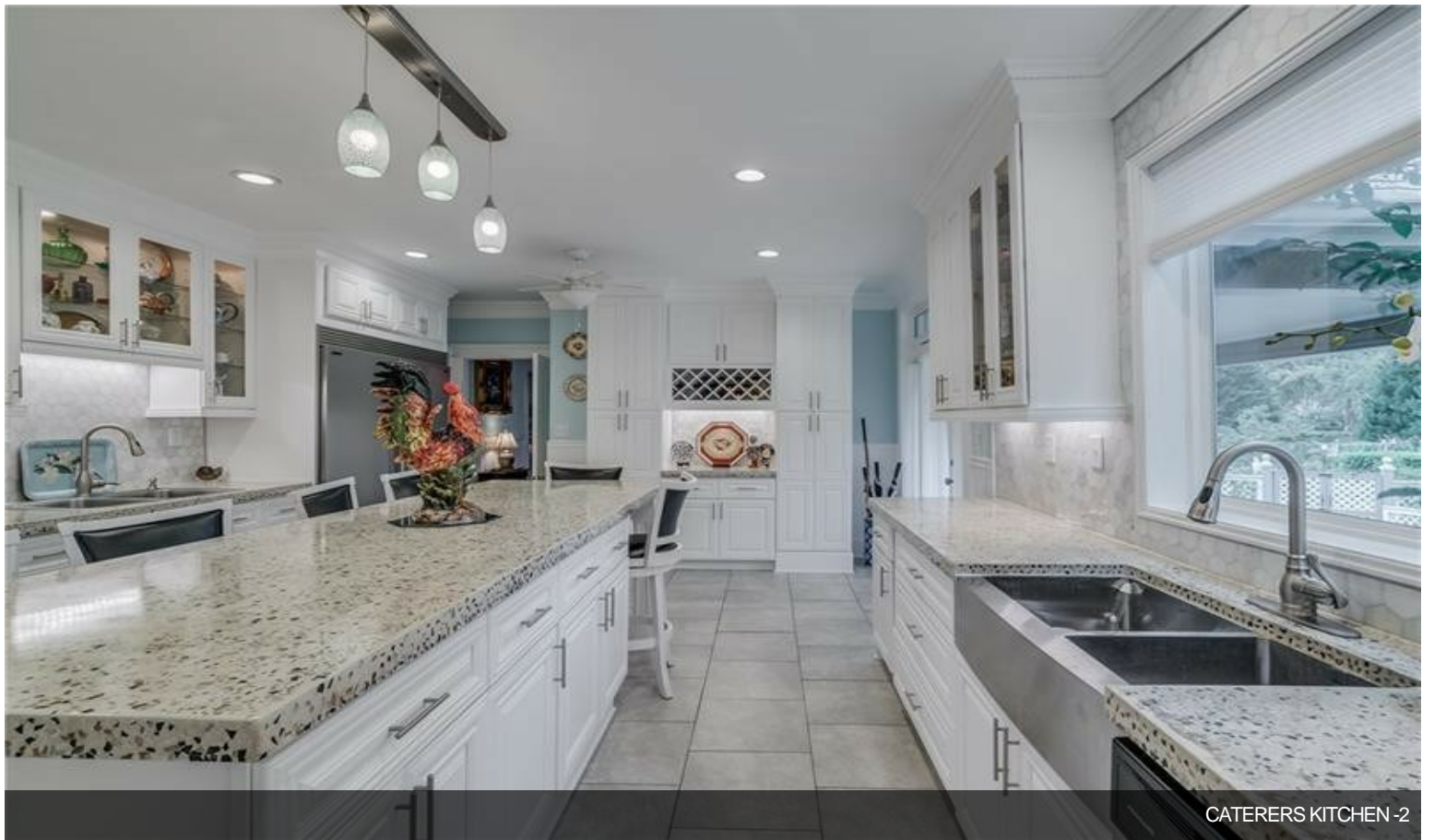
CATERERS KITCHEN - 2