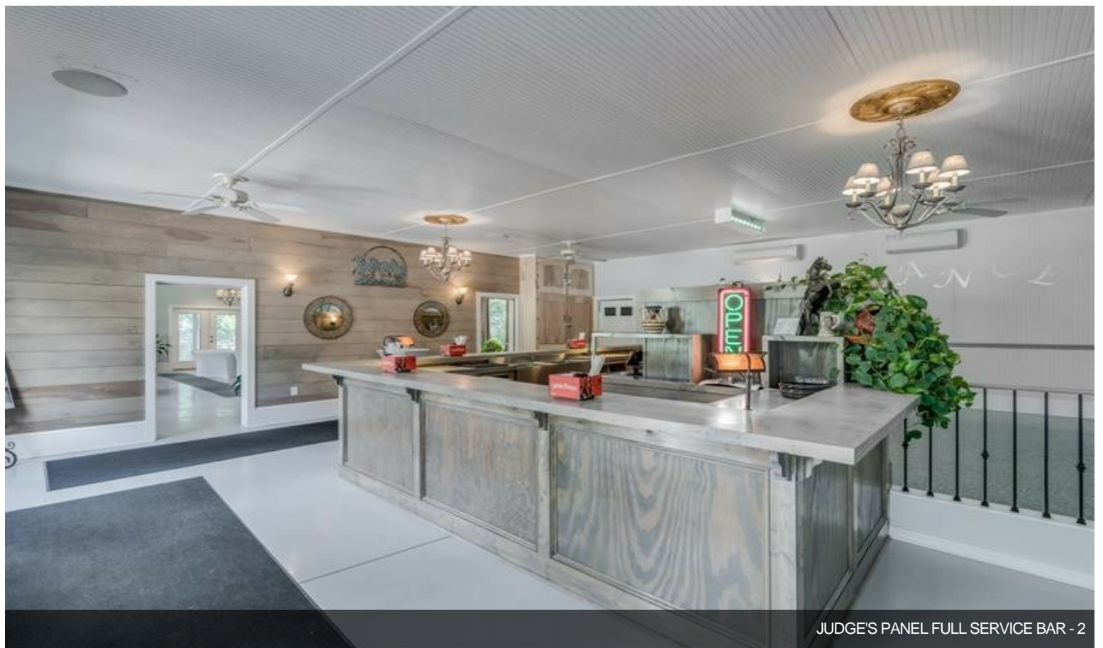
JUDGE'S PANEL FULL SERVICE BAR - 2