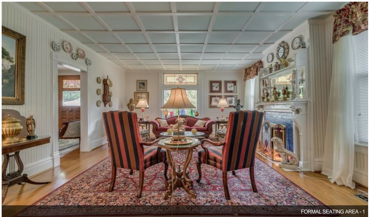
FORMAL SEATING AREA - 1