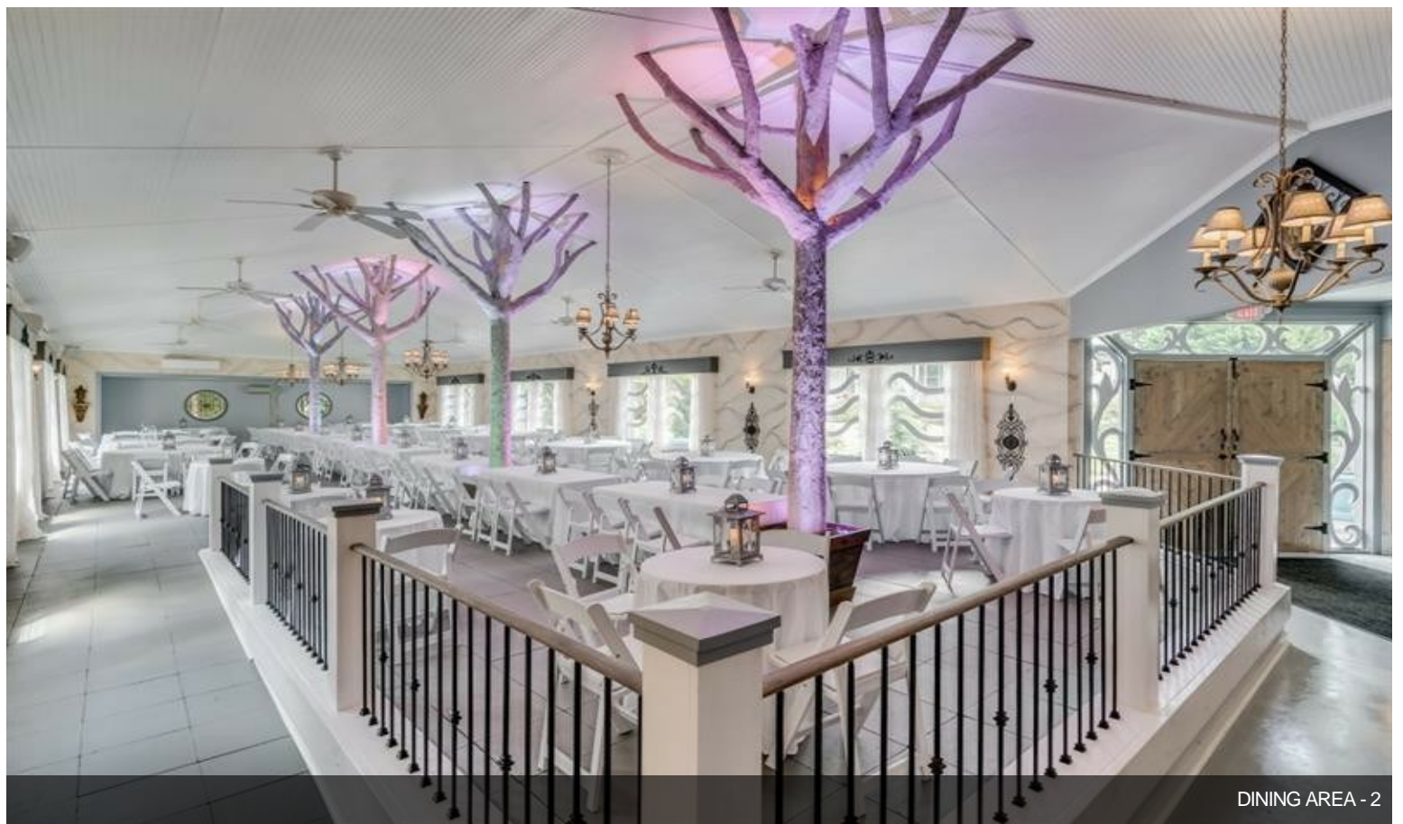
DINING AREA - 2