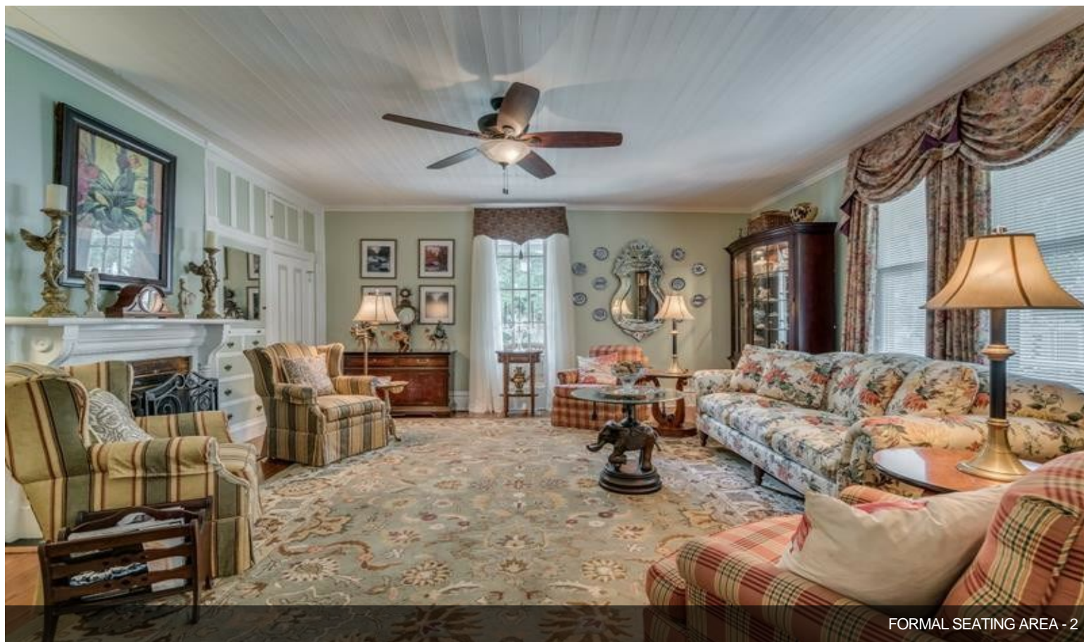
FORMAL SEATING AREA - 2