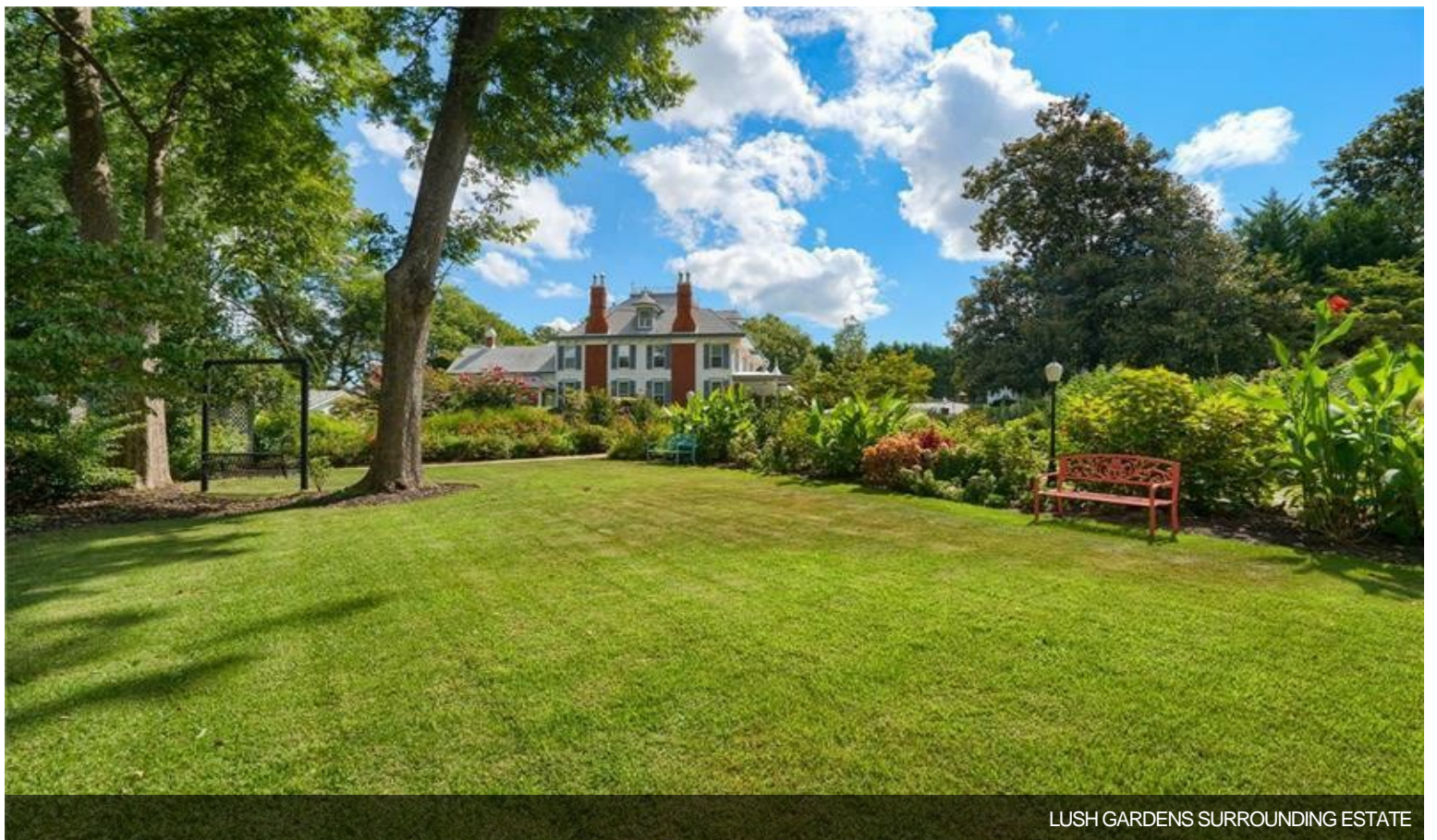
LUSH GARDENS SURROUNDING ESTATE