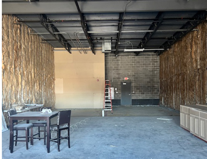
Suite 113: Former code ninja space