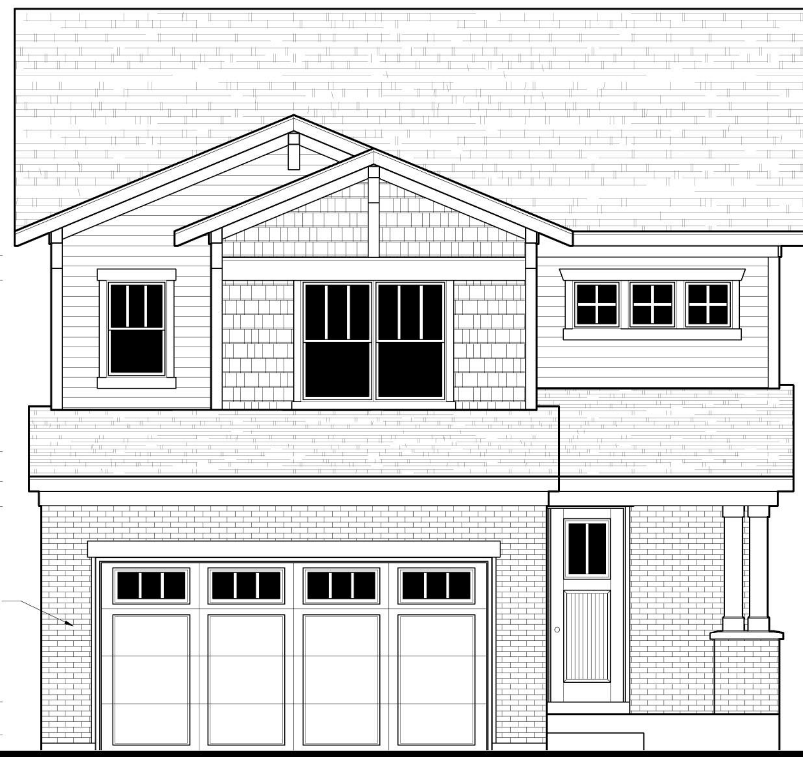
Plan 2 - Craftsman Front Elevation