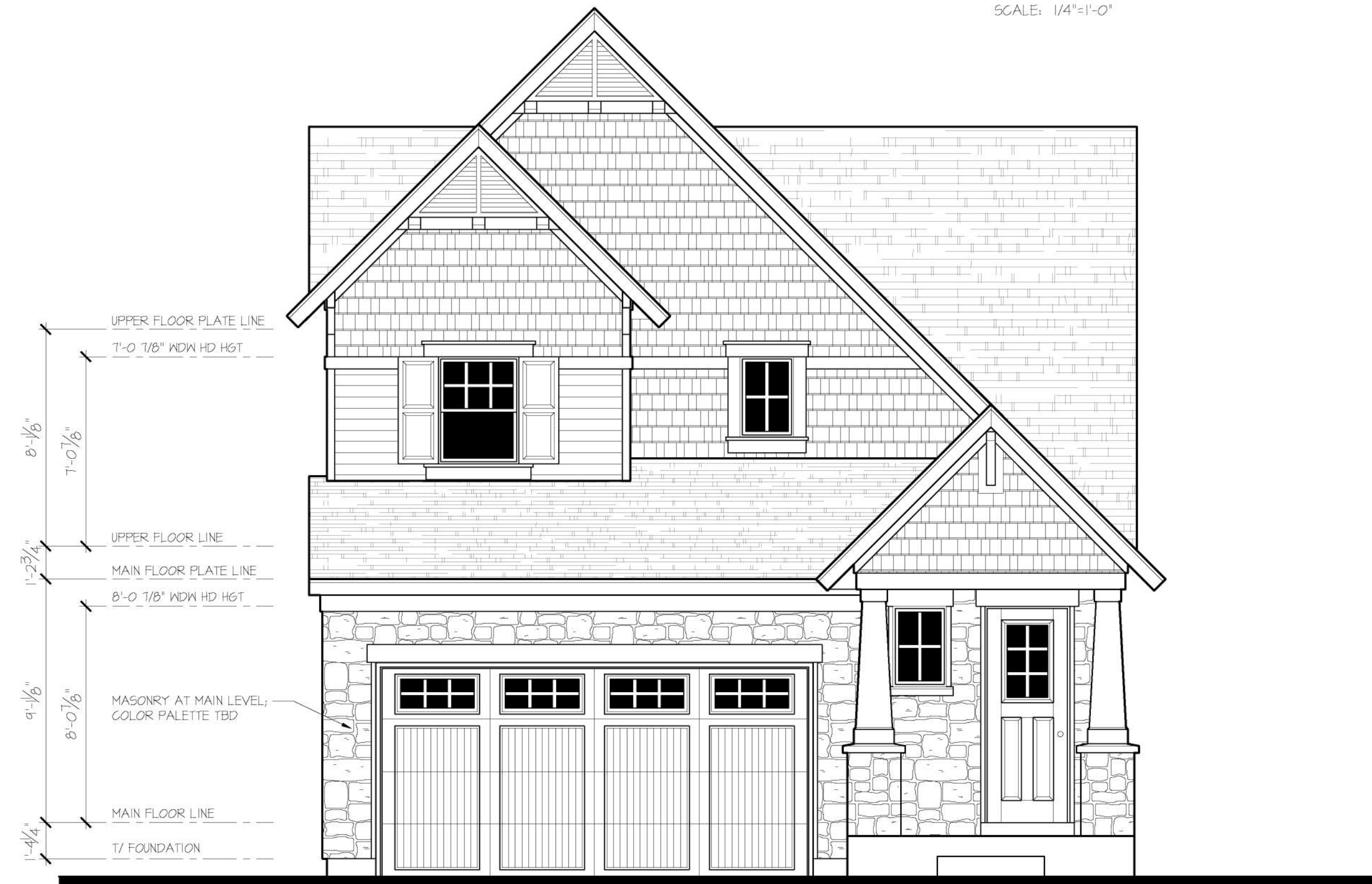
Plan 1: Shingle Front Elevation