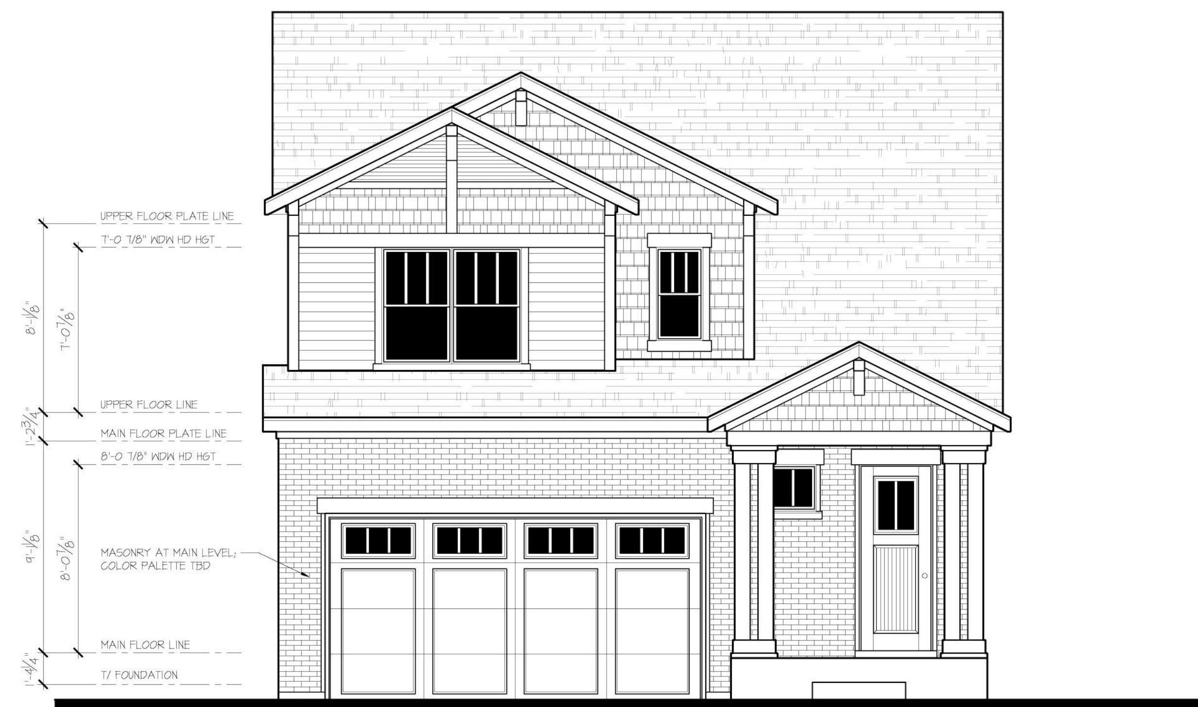
Plan 3 - Craftsman Front Elevation