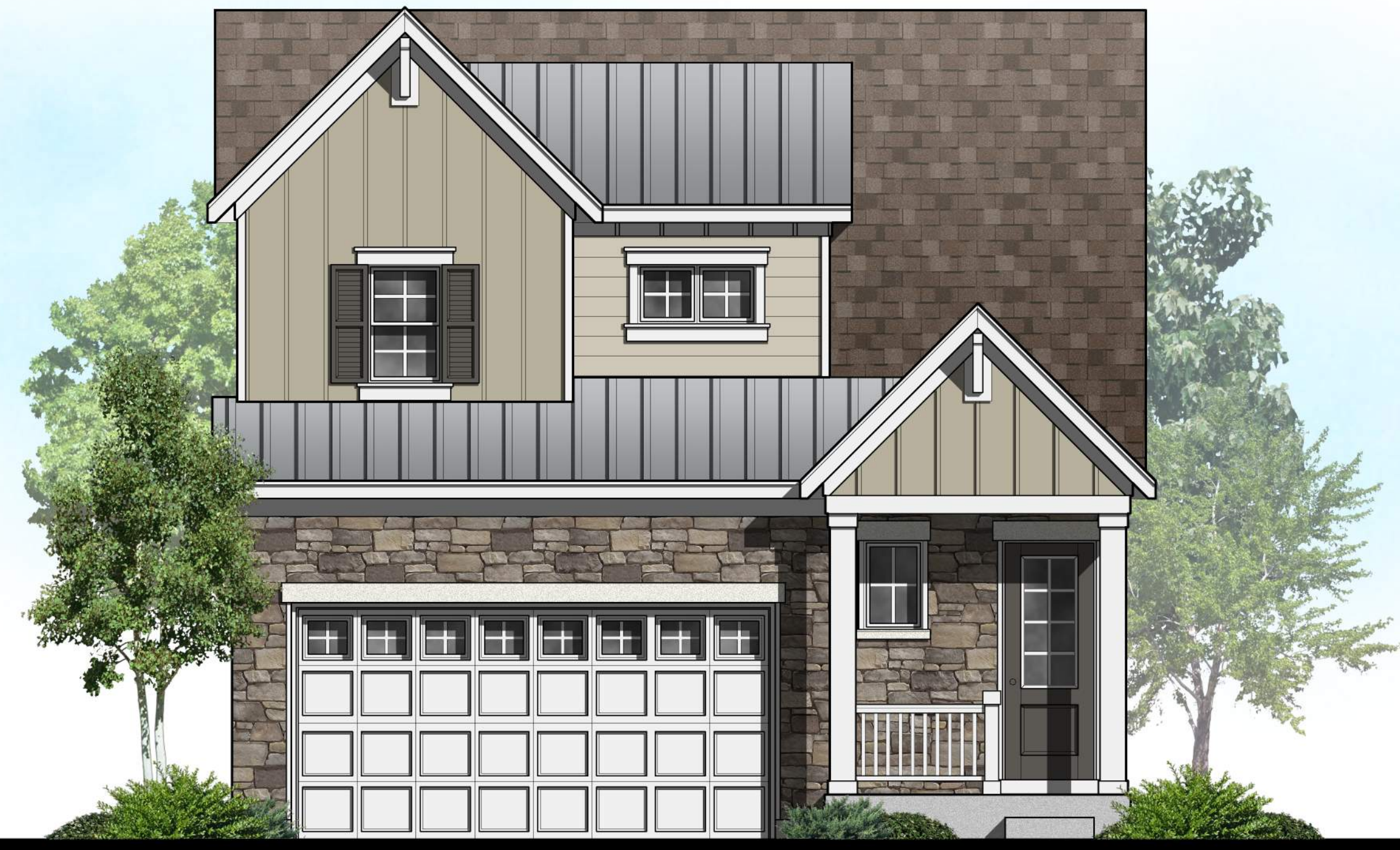
Plan 1: Farmhouse Front Elevation