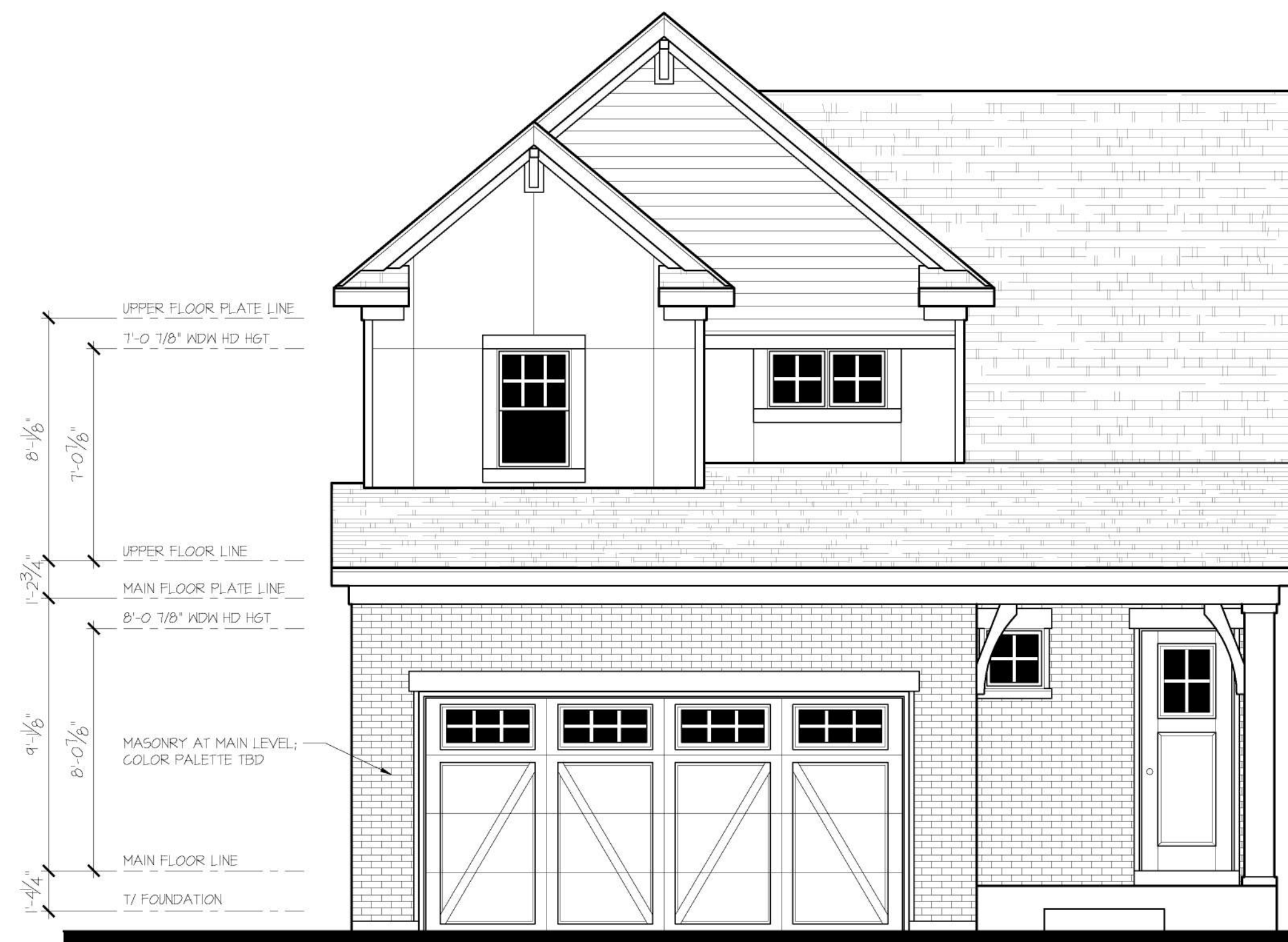
Plan 1: European Front Elevation