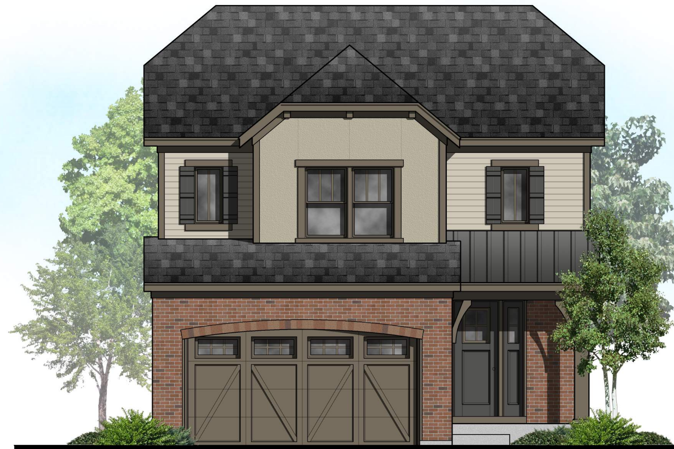
Plan 2 - European Front Elevation