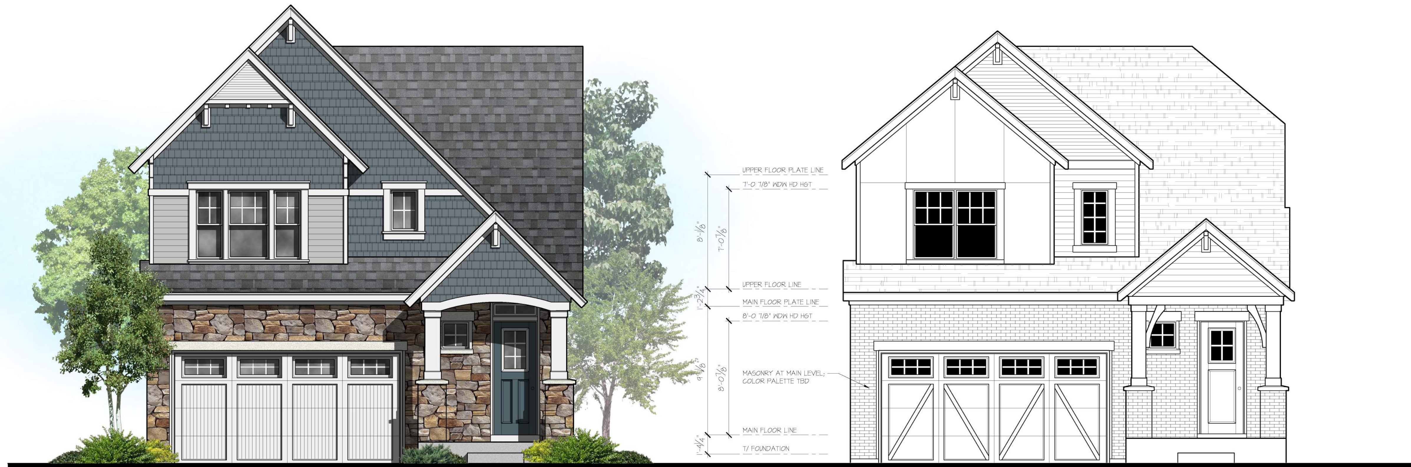
Plan 3 - Shingle Front Elevation