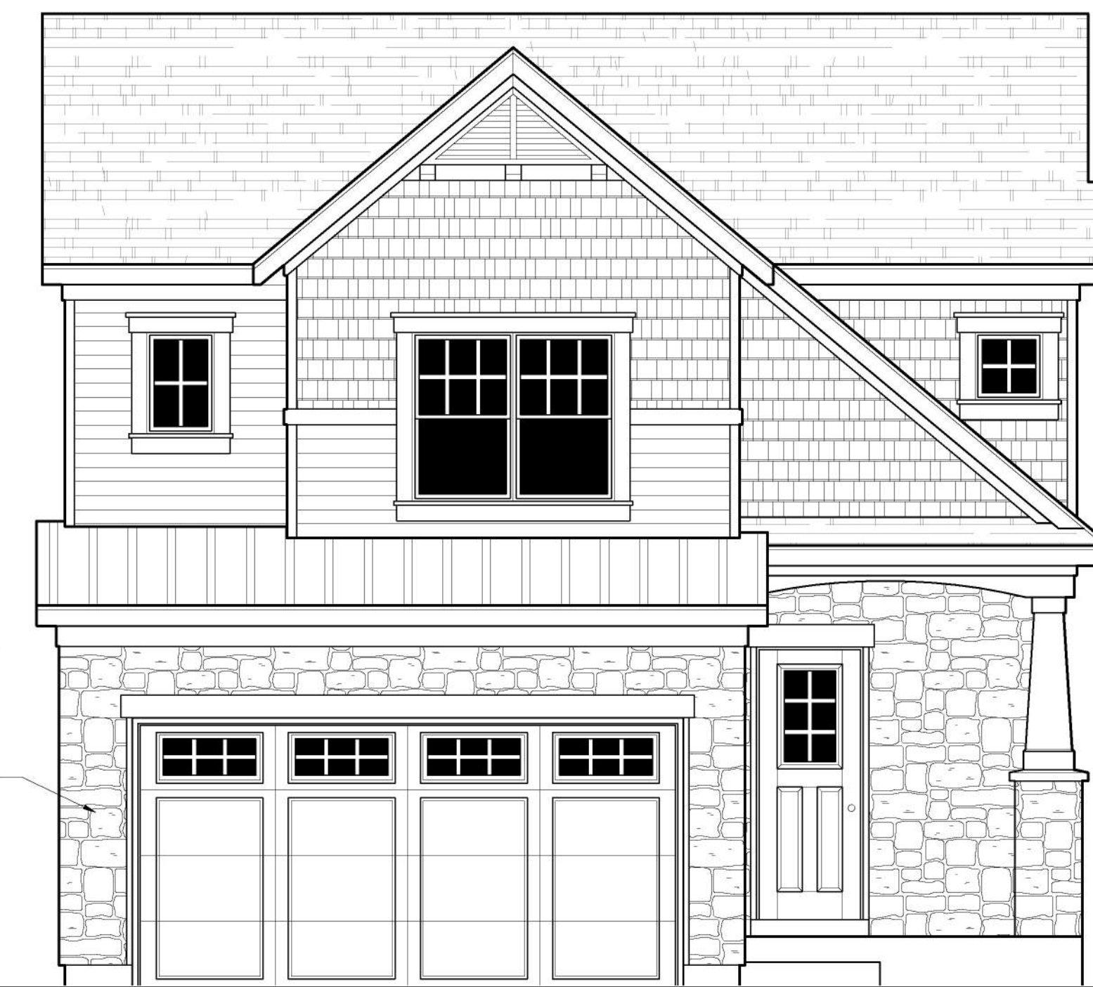
Plan 2 - Shingle Front Elevation