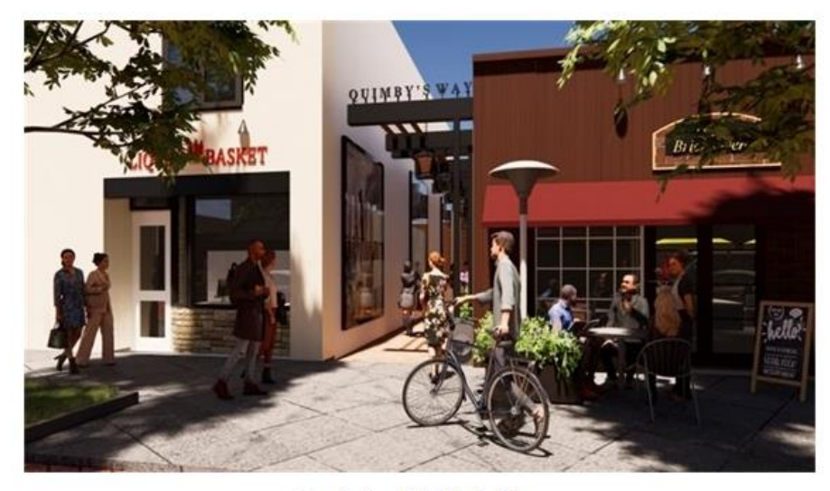
Rendering of Quimby's Way