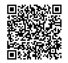
Scan for more info