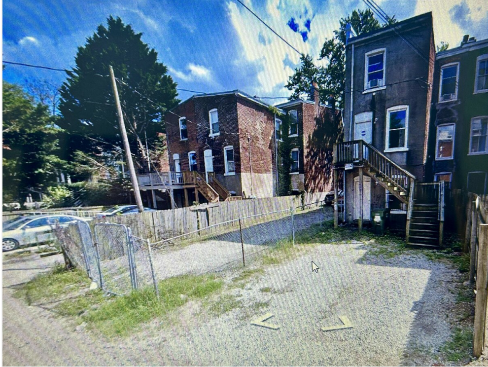
rear alley view