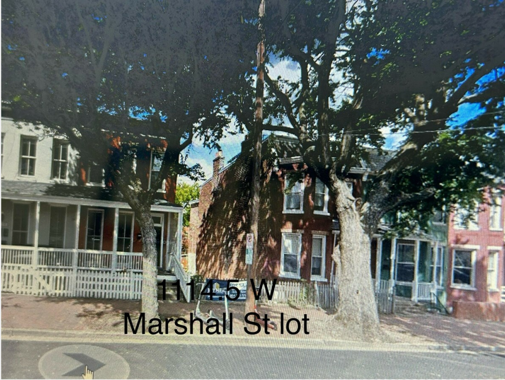
W. Marshall St view of front