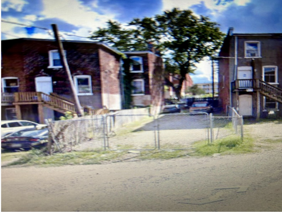
rear alley view