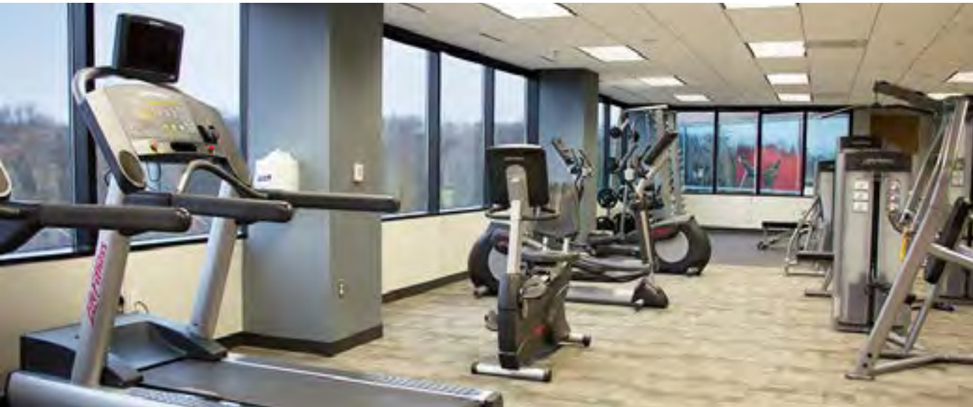
RENOVATED FITNESS CENTER