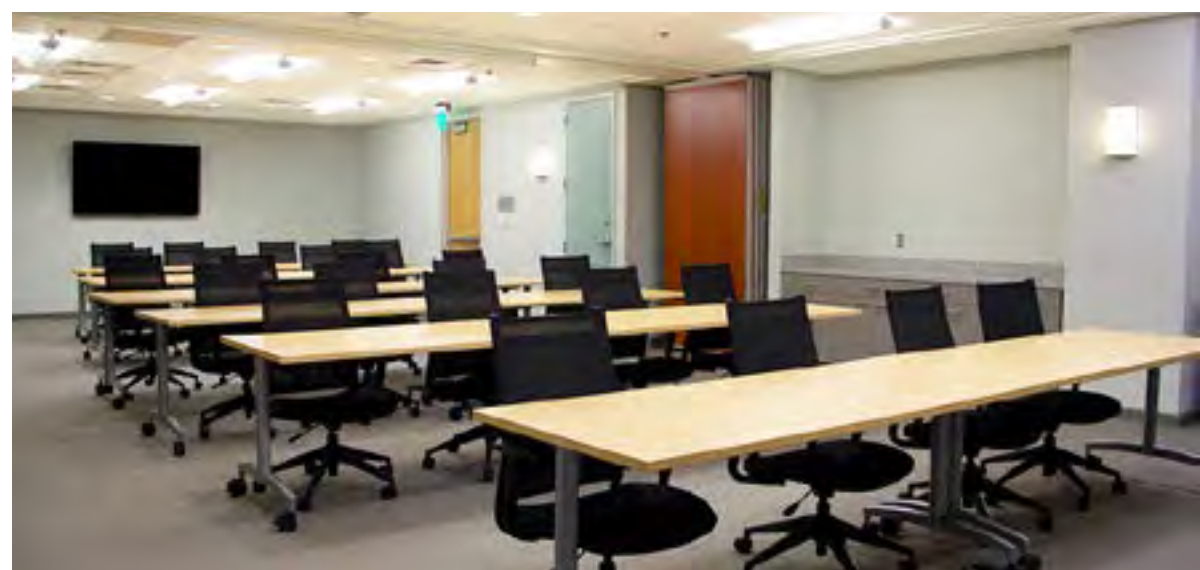
TENANT CONFERENCE FACILITY