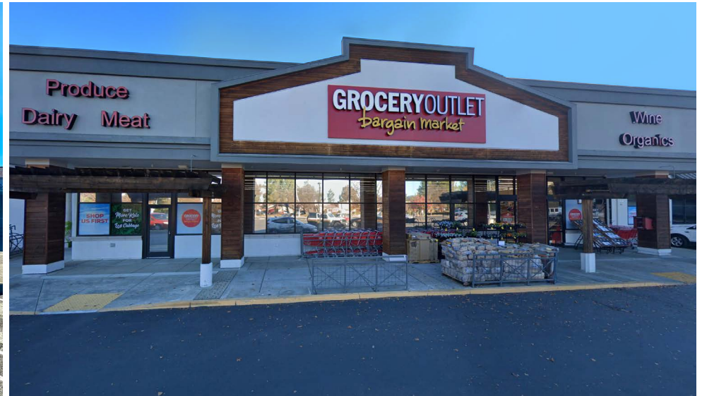
UNIT 110 - ±5,600 SF