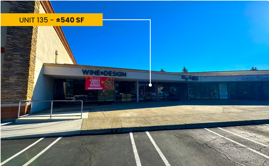
UNIT 135 - ±540 SF