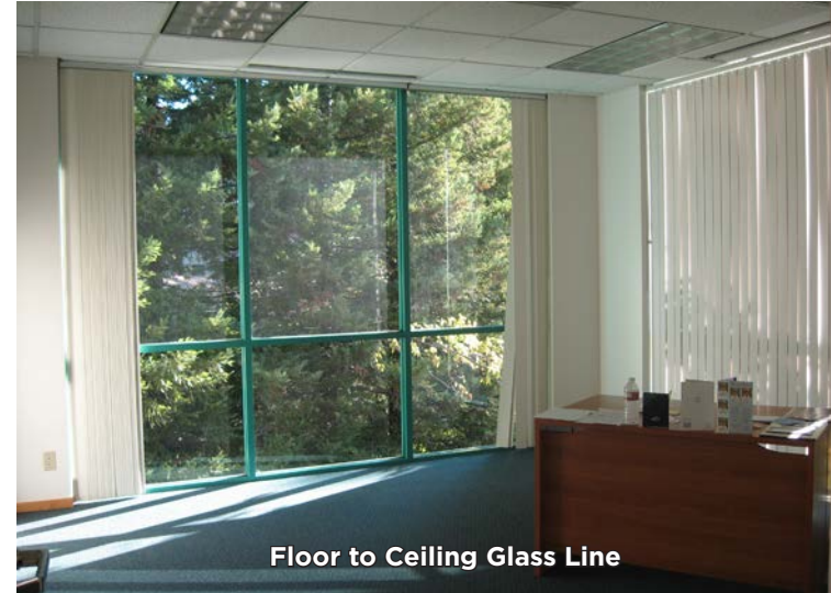
Floor to Ceiling Glass Line