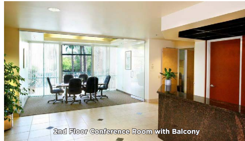
2nd Floor Conference Room with Balcony