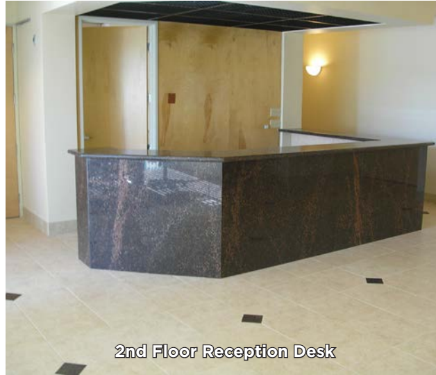
2nd Floor Reception Desk