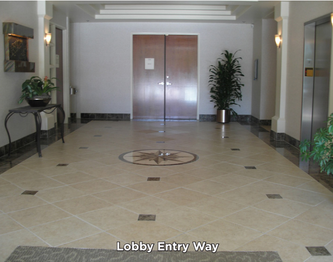
Lobby Entry Way