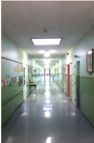
Clean, bright halls