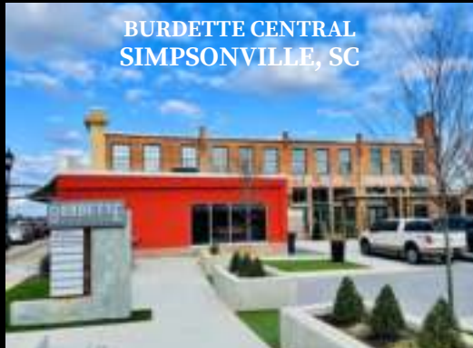
BURDETTE CENTRAL SIMPSONVILLE, SC