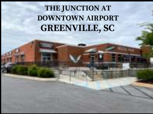
THE JUNCTION AT DOWNTOWN AIRPORT GREENVILLE, SC