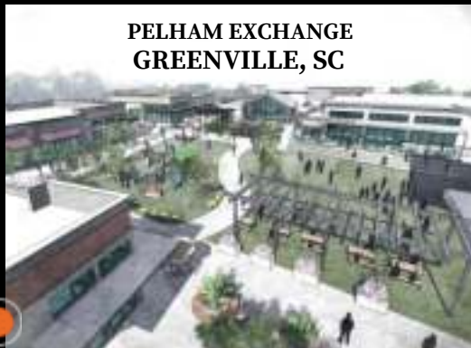
PELHAM EXCHANGE GREENVILLE, SC