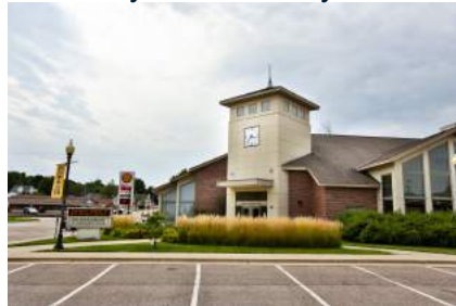
Library & Community Center