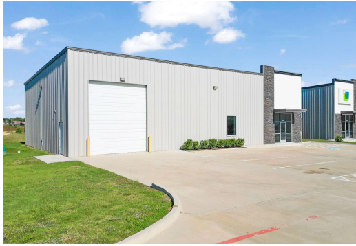
Main Entrance & Loading Bay