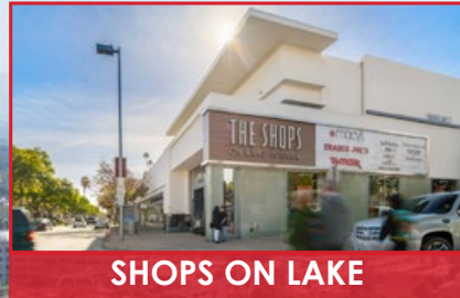
SHOPS ON LAKE