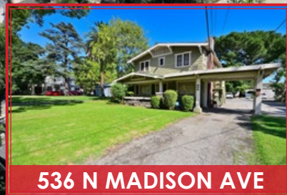
536 N MADISON AVE