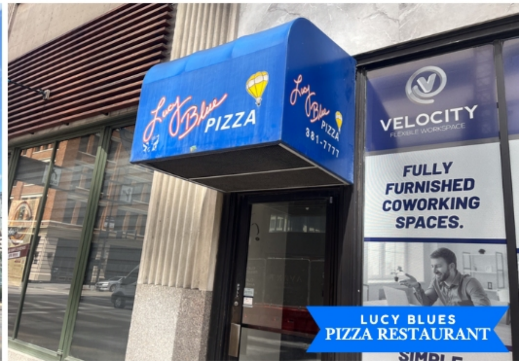
LUCY BLUES PIZZA RESTAURANT