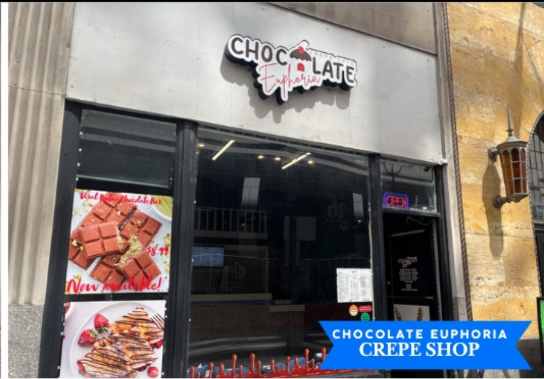
CHOCOLATE EUPHORIA CREPE SHOP