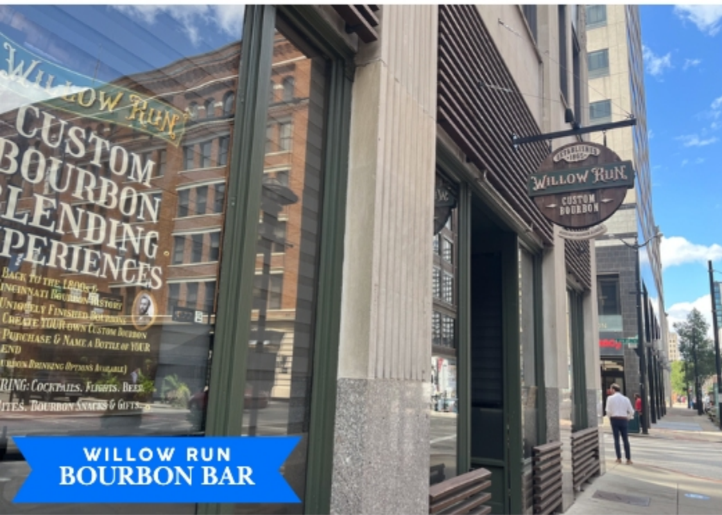
WILLOW RUN BOURBON BAR