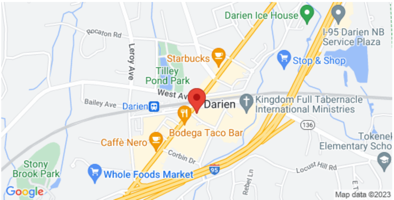
Property Photos (4 photos)