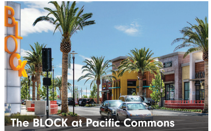
The BLOCK at Pacific Commons