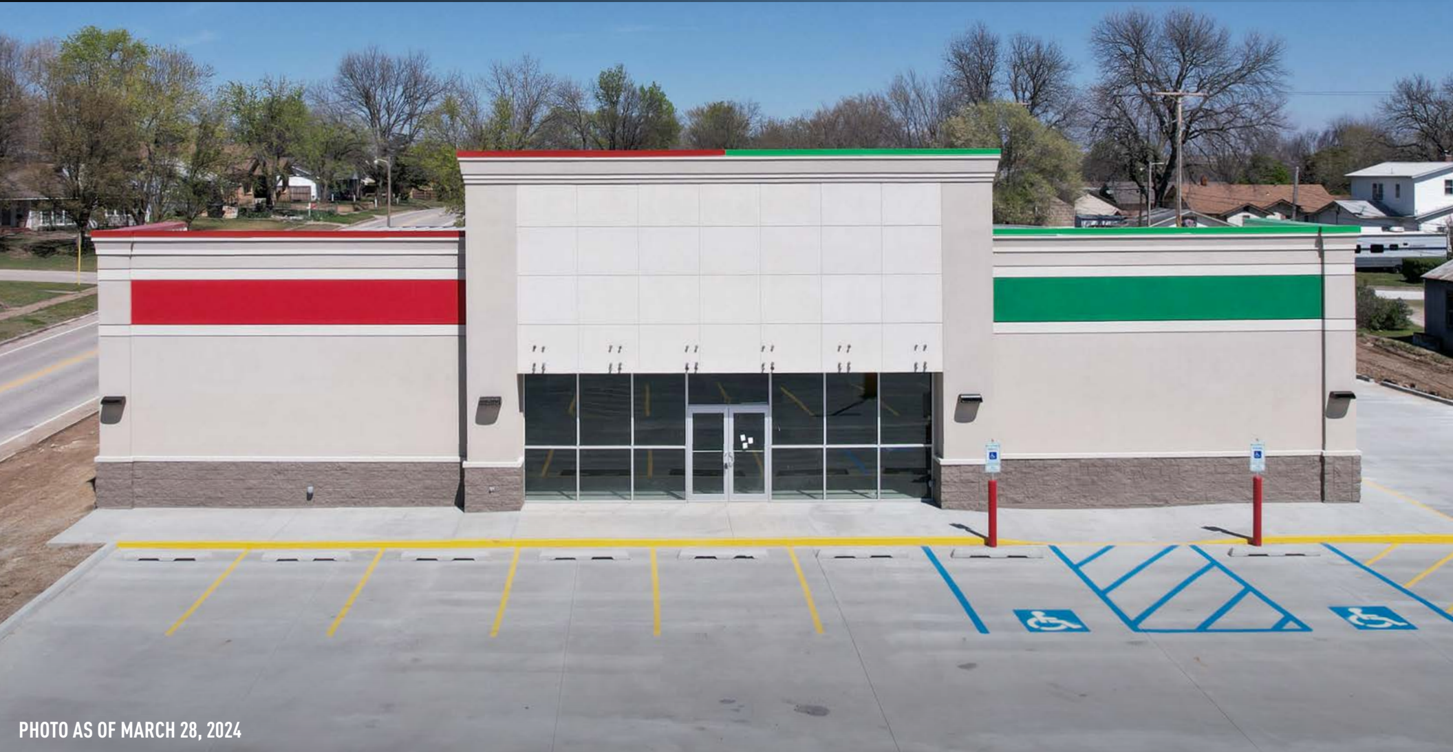
PHOTO AS OF MARCH 28, 2024

500 SOUTH MAIN STREET, FAIRFAX, OKLAHOMA