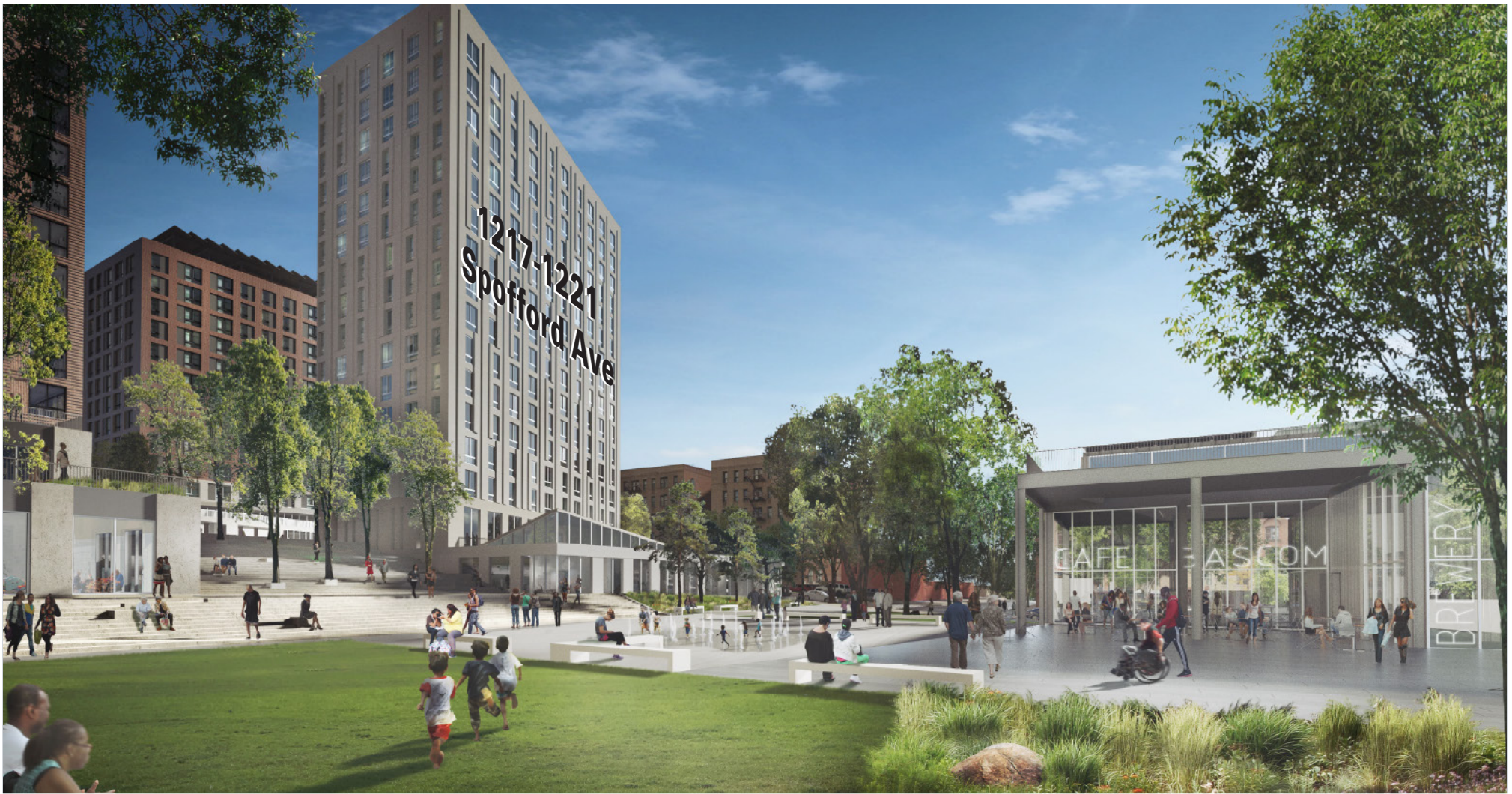
Rendering - View of Building 2B from the Public Plaza

1217-1221 SPOFFORD AVENUE - COMMUNITY FACILITY SPACE - 1,348 SF & 4,246 SF UNITS - CAN BE COMBINED