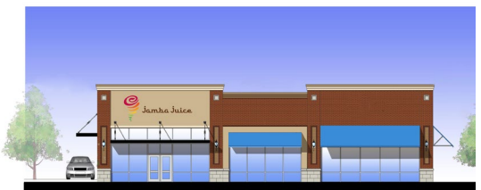
WEST ELEVATION - EXAMPLE MULTI-TENANT BUILDING