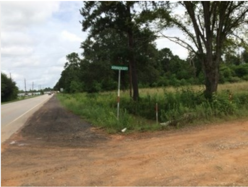
Two Streets intersection