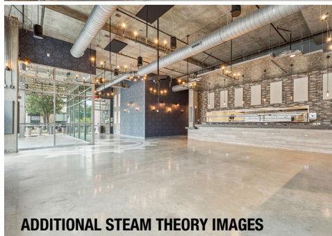
ADDITIONAL STEAM THEORY IMAGES