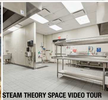
STEAM THEORY SPACE VIDEO TOUR