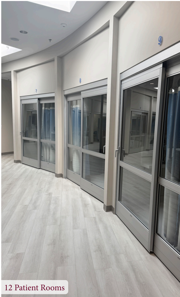
12 Patient Rooms

5234 LITTLE ROAD | NEW PORT RICHEY, FL 34653