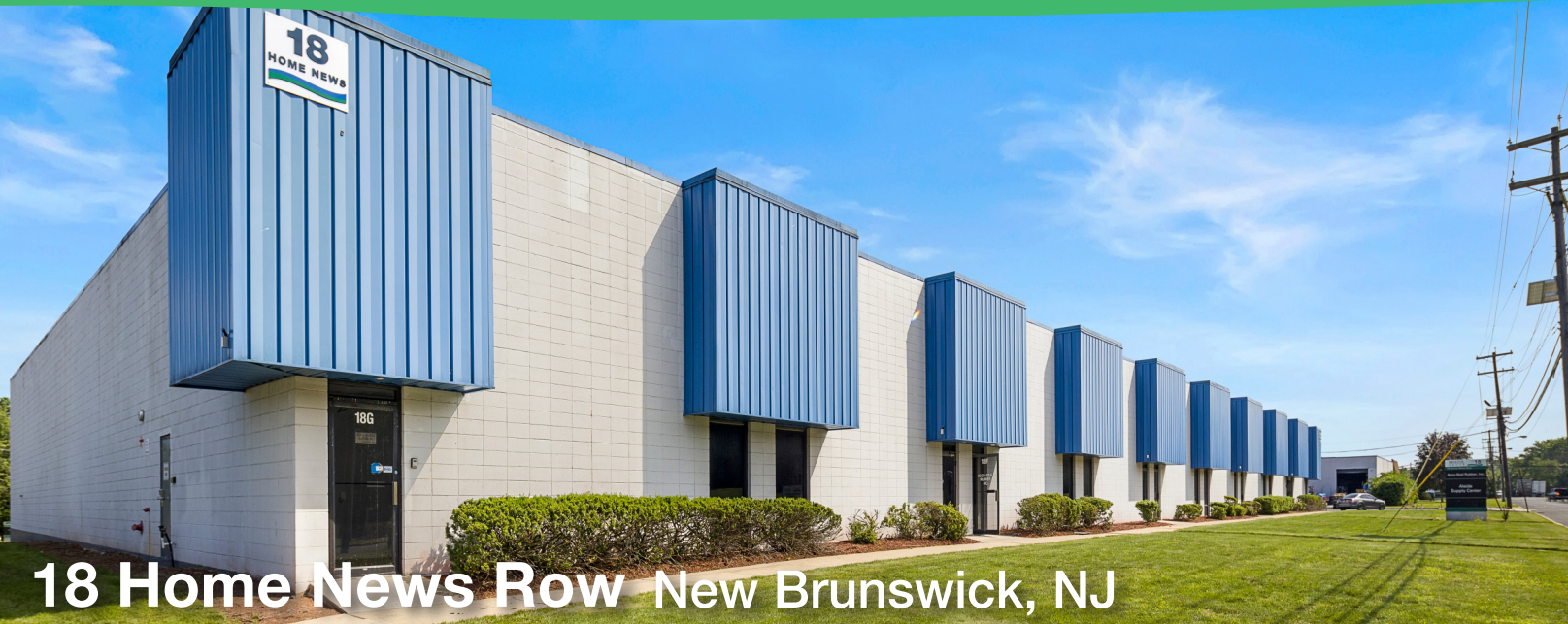
18 Home News Row New Brunswick, NJ