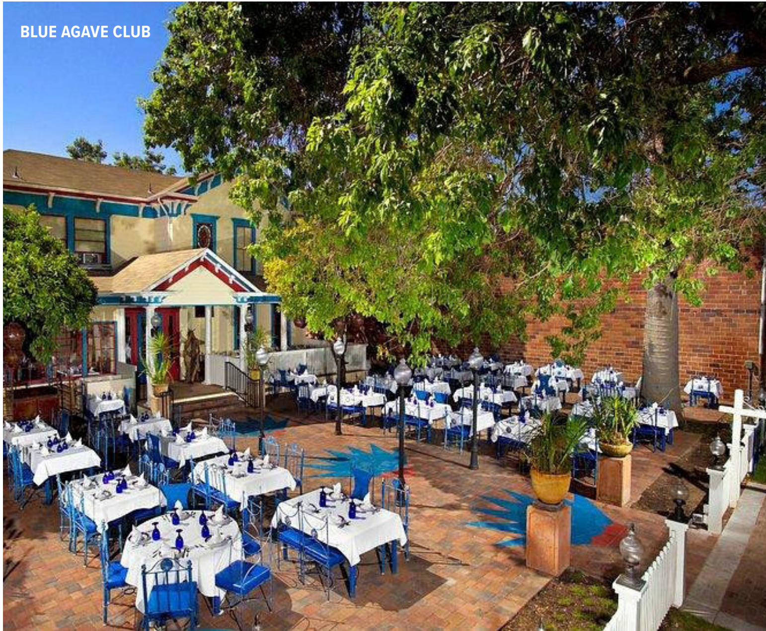
BLUE AGAVE CLUB