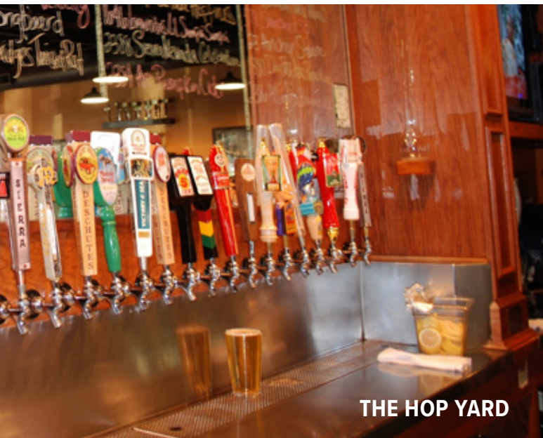
THE HOP YARD