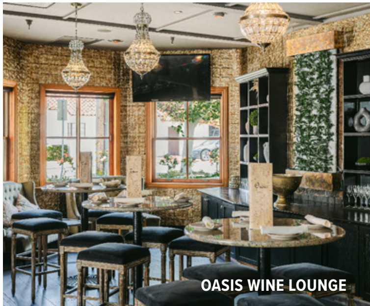
OASIS WINE LOUNGE

in Pleasanton, California, offers a vast assortment of outstanding Mexican food. The atmosphere is what you would expect from a high-end dining establishment and Blue Agave Club fits that bill. The restaurant is known for our award-winning 100% blue agave tequila margaritas, as well as our secret homemade sweet and sour mix.