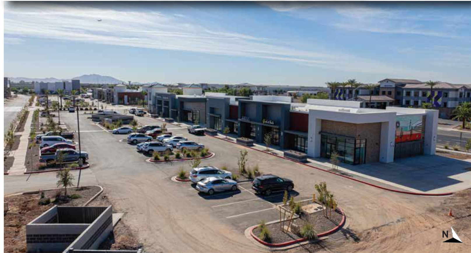
Power Road Retail Shops