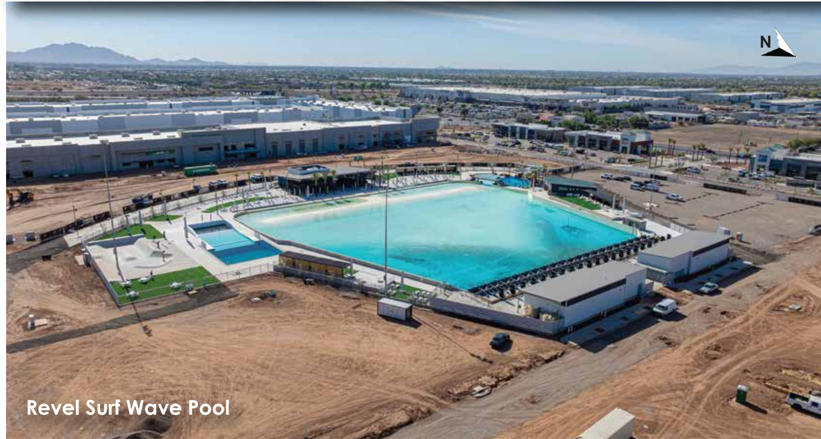
Revel Surf Wave Pool