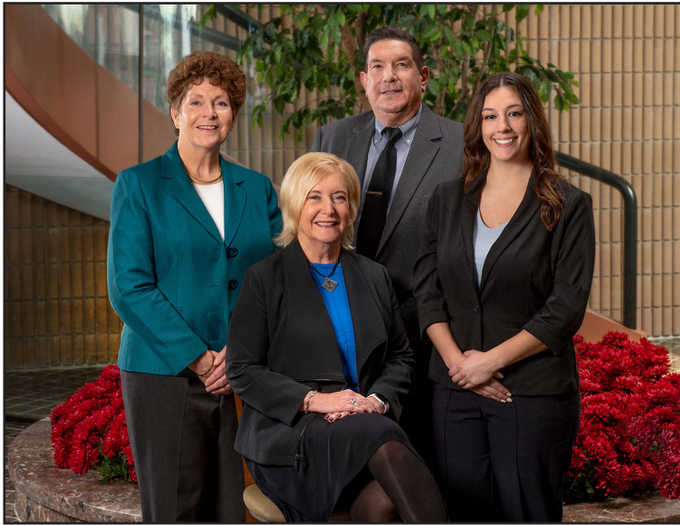
Customer Service Department