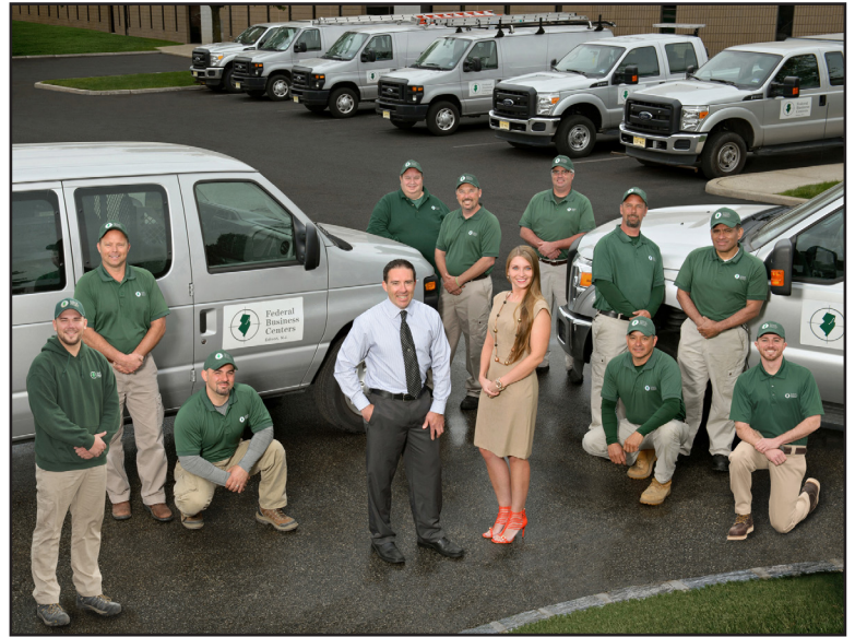
Building Maintenance Department