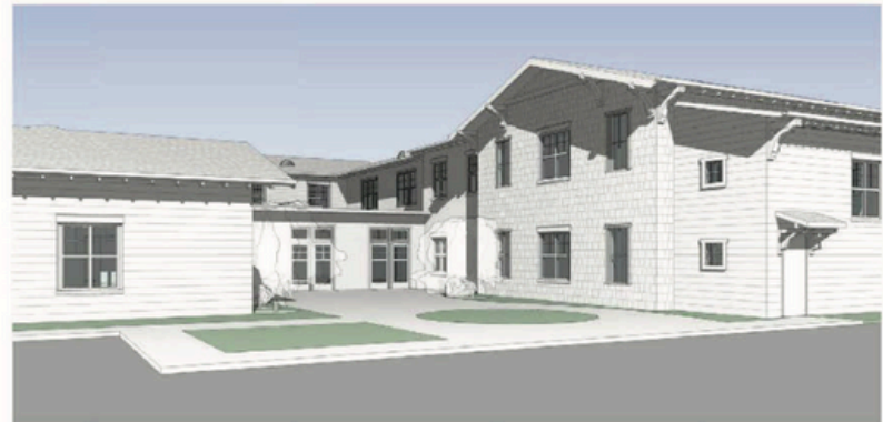
VIEW OF COURTYARD 2