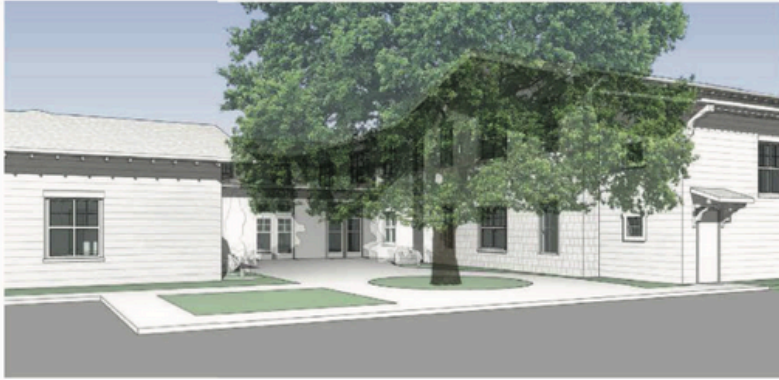
VIEW OF COURTYARD 2 w/OAK TREE 1/2" = 1'-0" 4