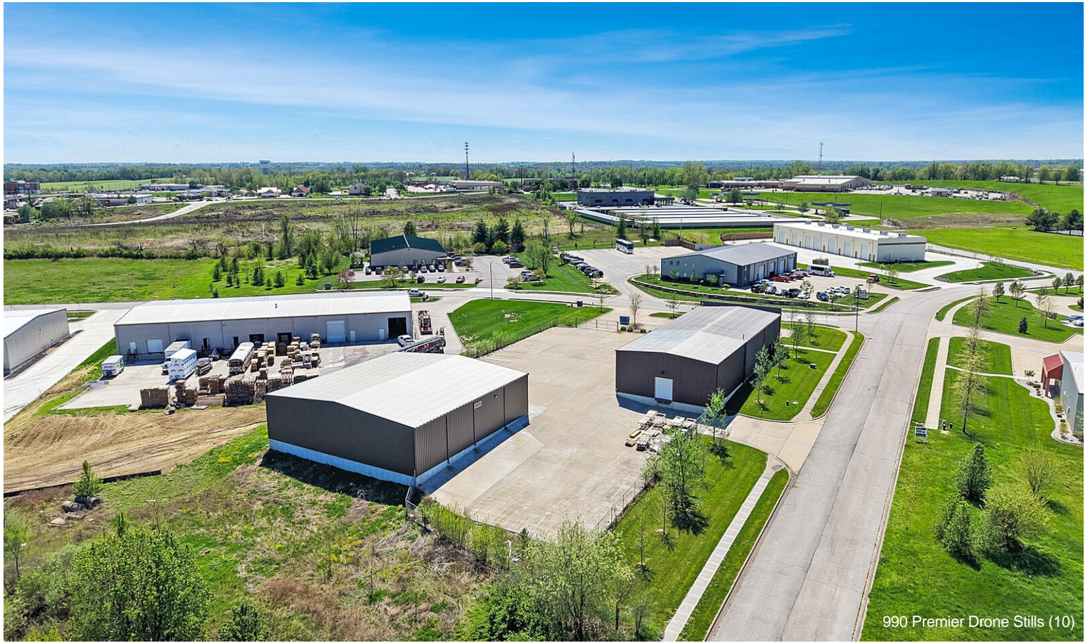
990 Premier Drone Stills (10)