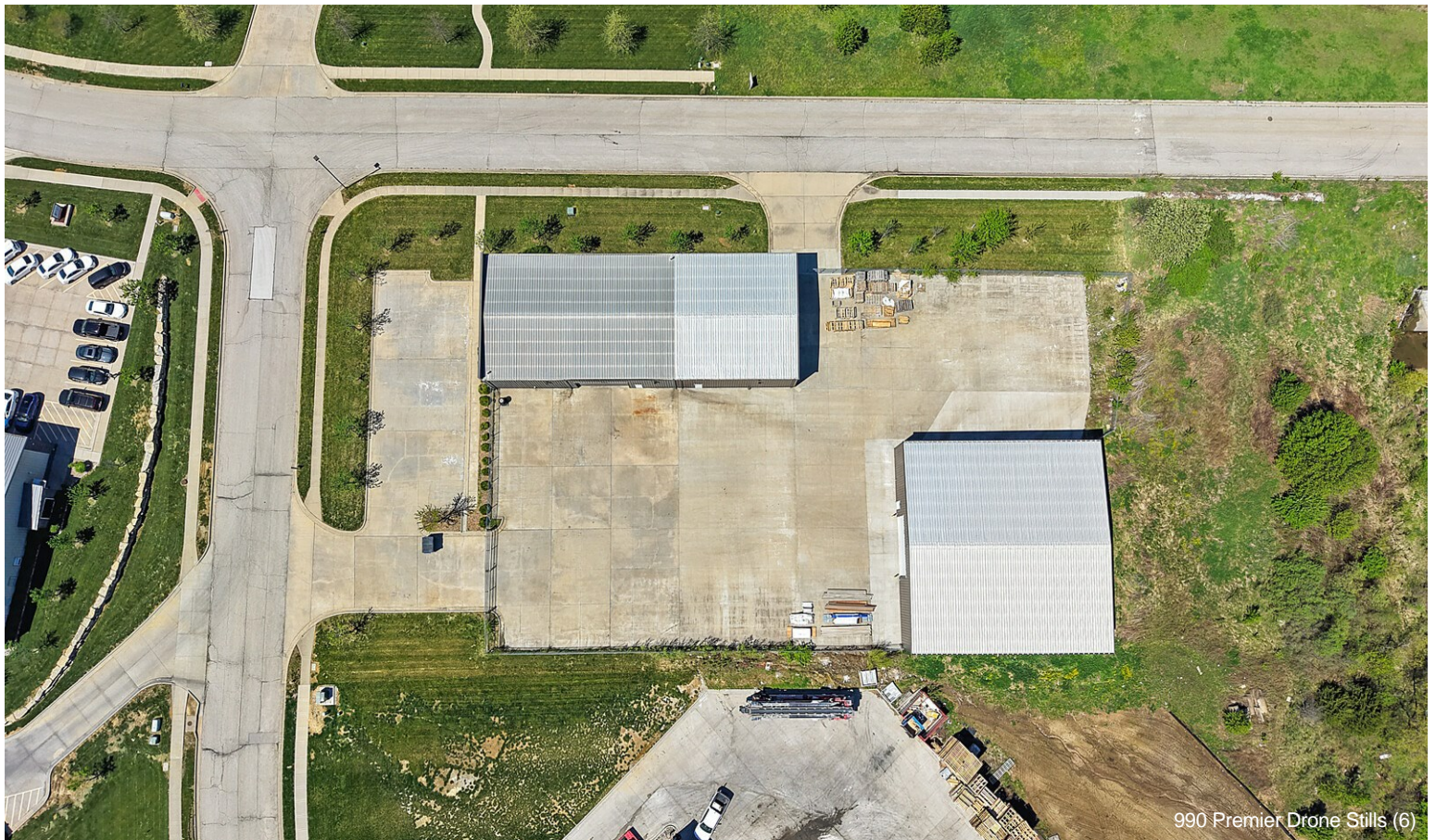
990 Premier Drone Stills (6)