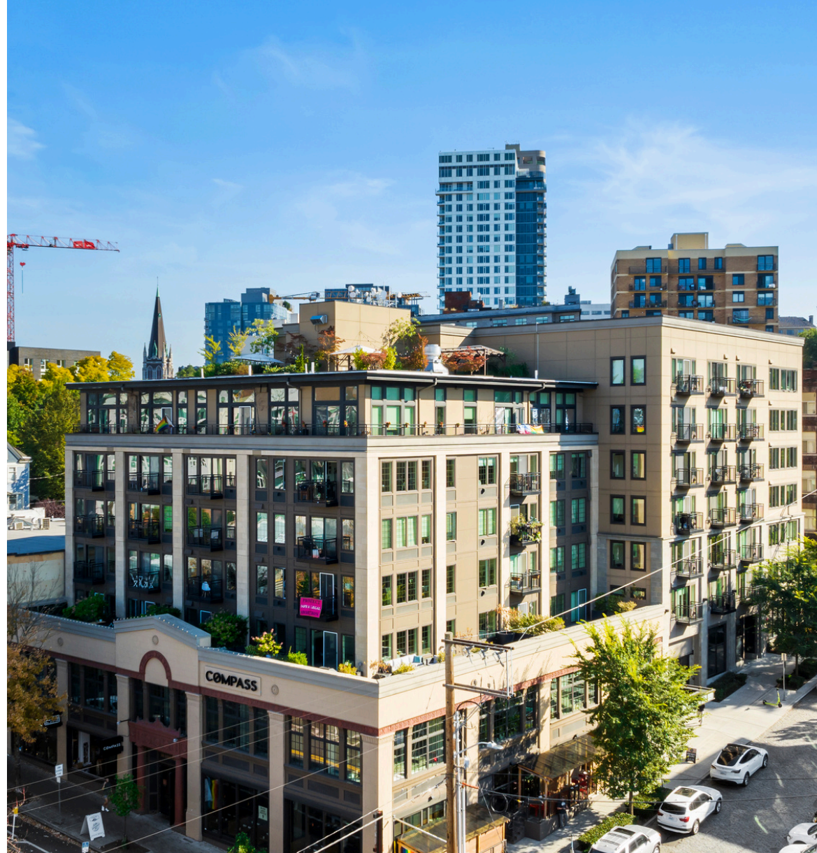
Above: Aerial Photo of Dunn Motors Building