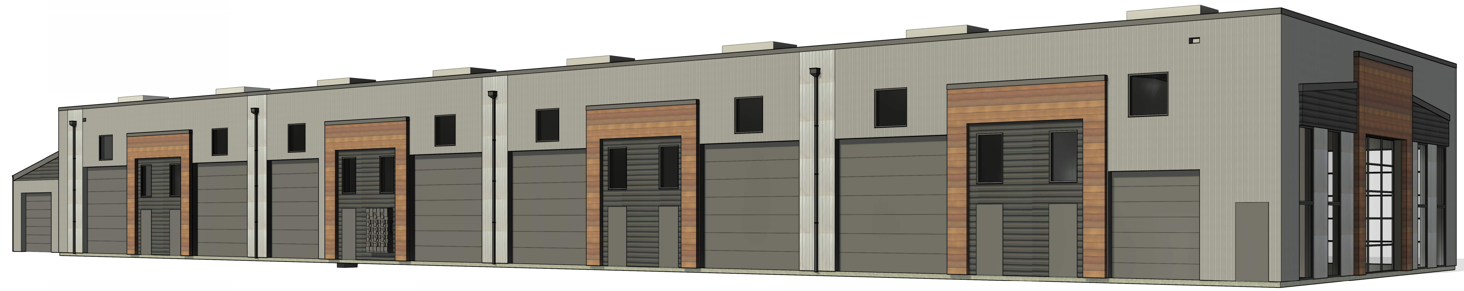
4 3D VIEW - REAR MA3

1215 CHAMBERS - BLDG #6 1215 CHAMBERS AVE, EAGLE, CO 81631