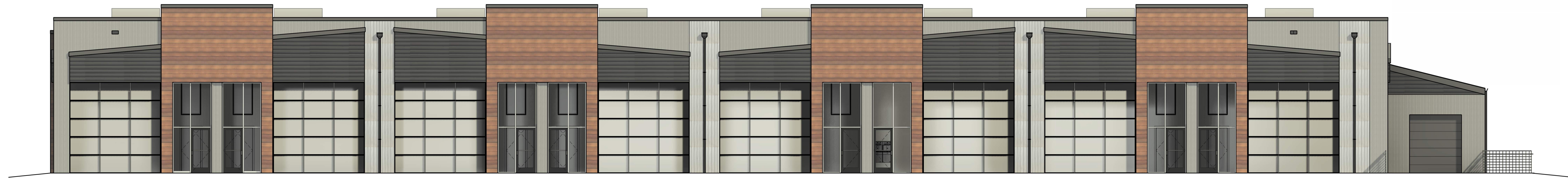
1 SOUTH ELEVATION MA2 1/8" = 1'-0"