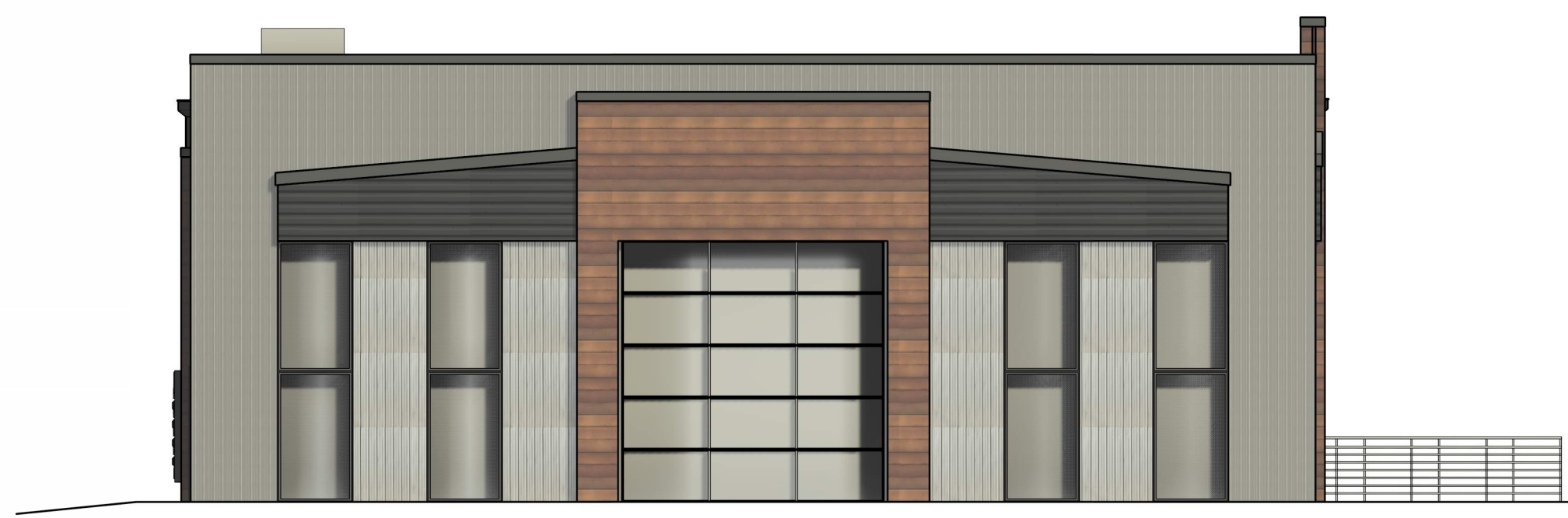
3 WEST ELEVATION MA2 1/8" = 1'-0"