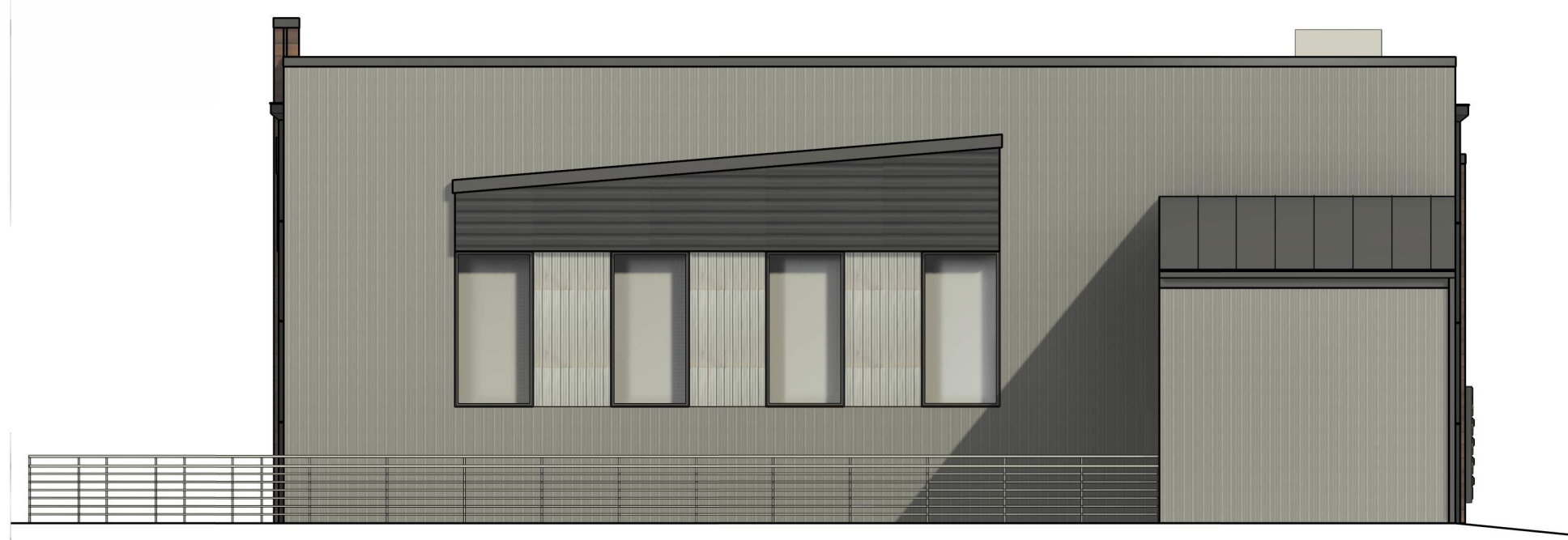
2 EAST ELEVATION MA2 1/8" = 1'-0"