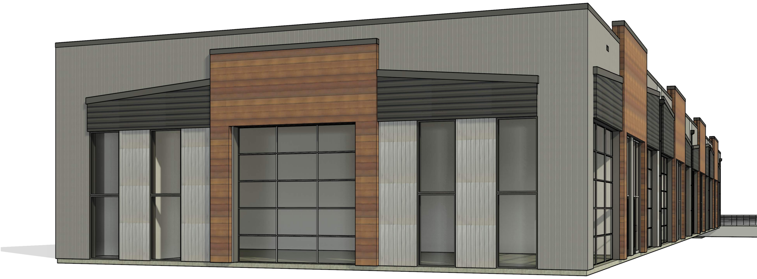
2 3D VIEW - SIDE 1 MA3