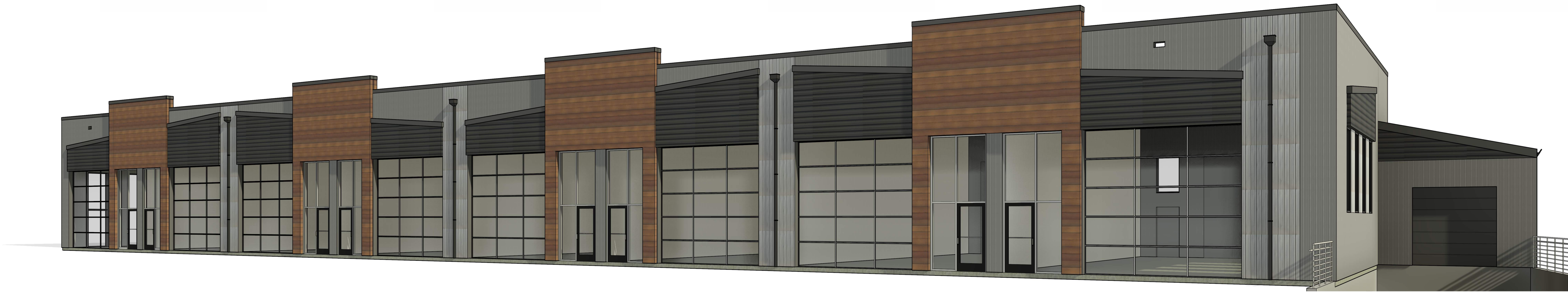
1 3D VIEW - FRONT MA3