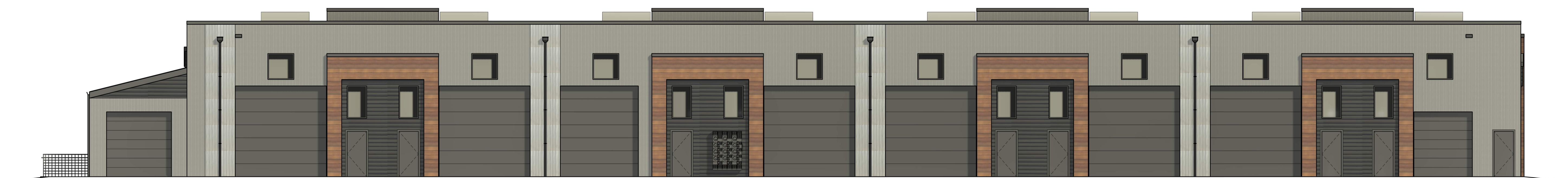
4 NORTH ELEVATION - MARKETING MA2 1/8" = 1'-0"