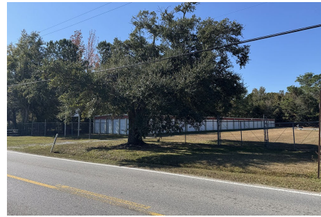
Value Storage Units of Pass Christian