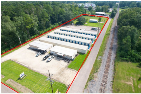
Value Storage Units of Hammond 1