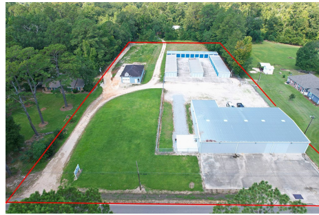
Value Storage Units of Hammond 2